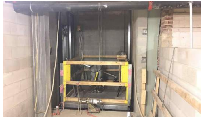
Elevator #1 Installation