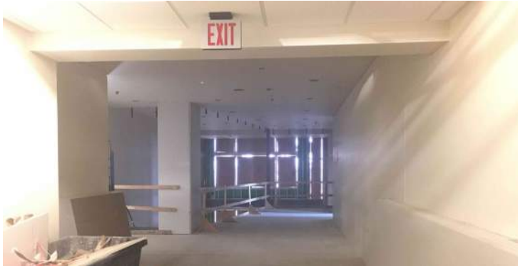
Gypsum Board Installation in Area A Atrium