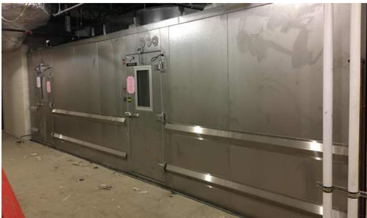
Kitchen Walk-In Coolers in Area D Cedar Level