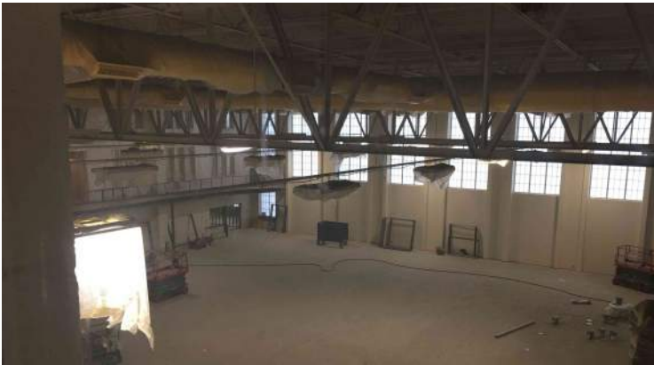
Competition Gym View from Area B Second Floor Science Classrooms