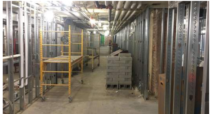
Interior Masonry Partition Walls in Area A Washington