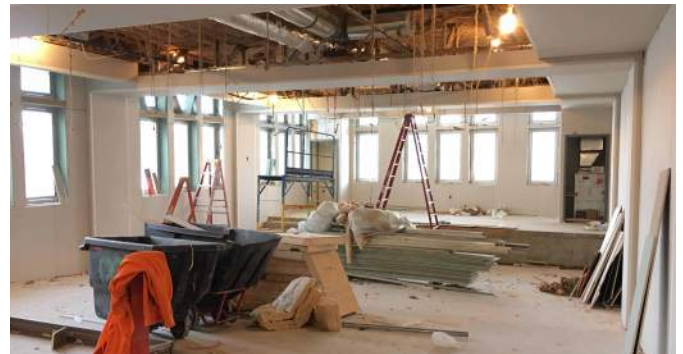
Gypsum Board Installation in Area F Cedar Level Mini Auditorium