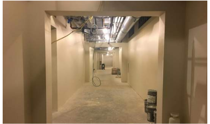
Area G 2nd Floor Science Hall