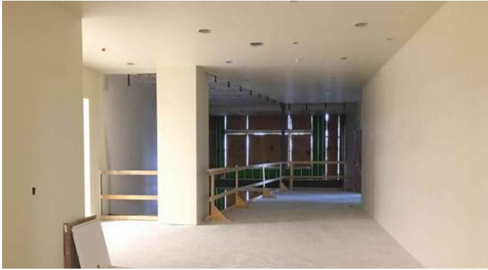
Area A 3rd Floor Atrium