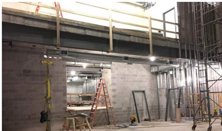
Area C Washington Level Scene Shop