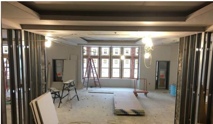
Area G 3rd Floor Locker Area Bay Windows