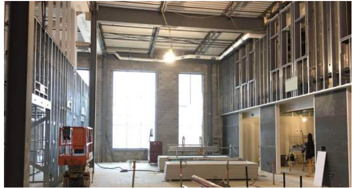
Area F Cedar Level Reading Area