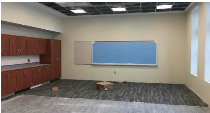
Markerboard & tackboard installation on 3rd floor Area A