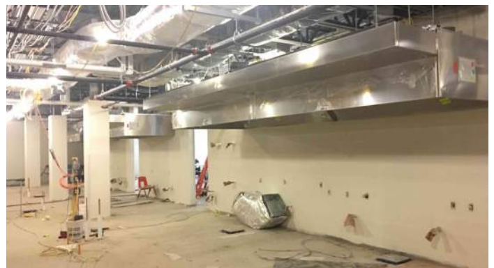
Stainless hood installation on Cedar Level Area E