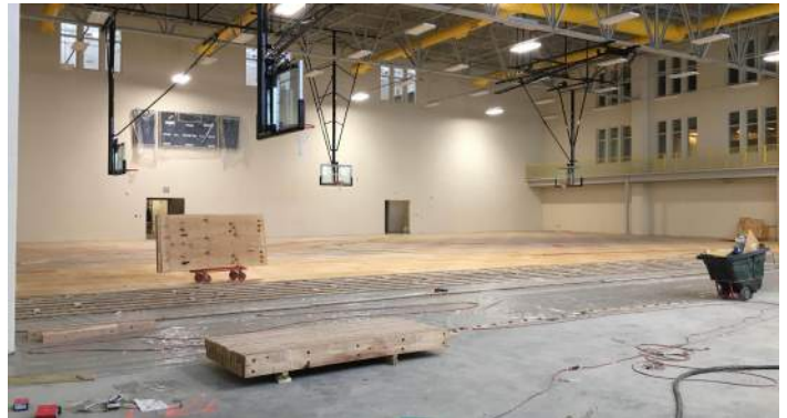
Wood flooring installation on Washington Level Area B