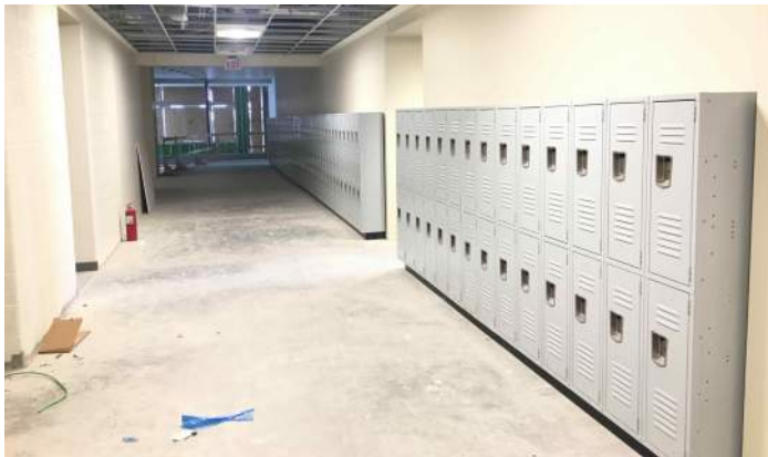
Metal locker installation on Cedar Level Area A