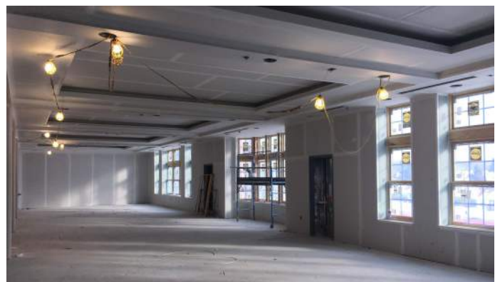
Coffered ceiling taping on 3rd floor Area G