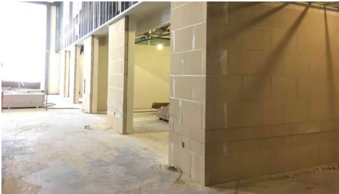
Interior stone veneer on Cedar Level Area E