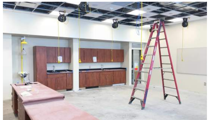
Cord Reel Installation in Area A 3rd Floor