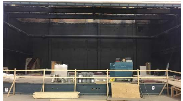
Painting Stage in Area G Cedar Level Auditorium