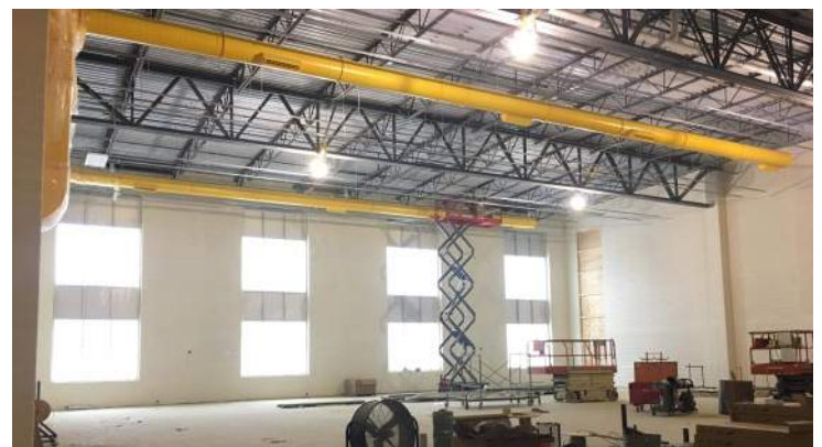
Lighting Installation in Area C Washington Level