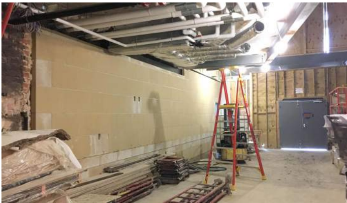
Interior Masonry Stone Veneer Installation in Area F Vestibule