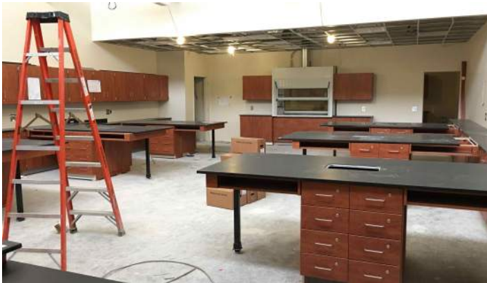
Casework Installation in Areas B & E 2nd Floor