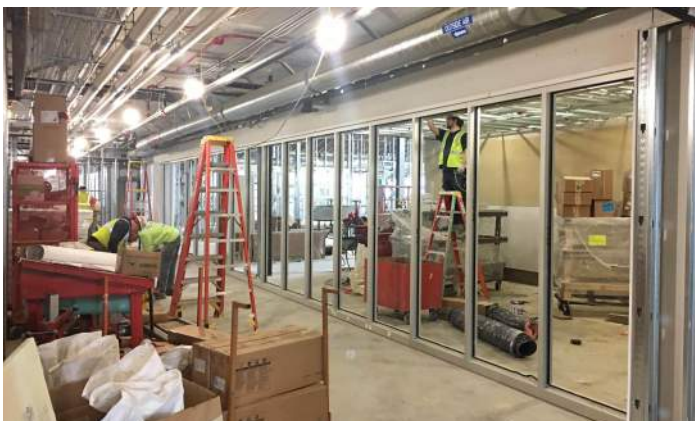
Curtain Wall Installation in Area E Cedar Level