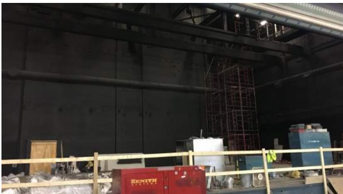
Painting Stage Walls Area G Cedar Level