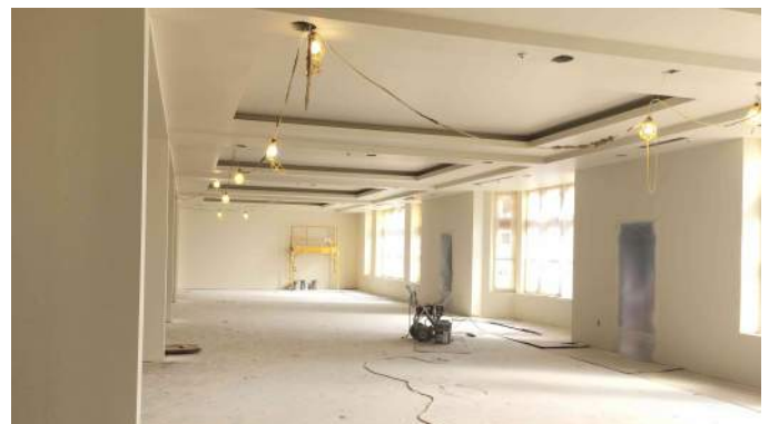
Painting Chauffeured Ceilings Area G 3rd Floor