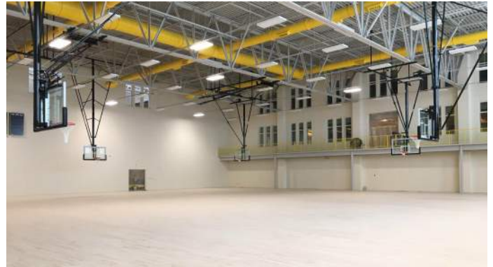
Wood Floor Installation Area B Washington Level Competition Gym