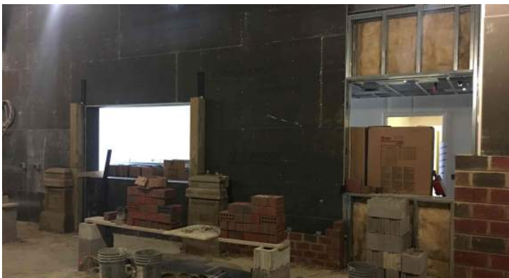
Interior Stone Veneer Area F Cedar Level