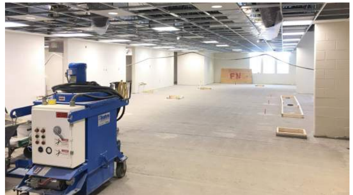
Quarry Tile Floor Prep Area D Kitchen