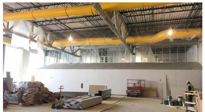
Drywall Installation Area E Dining Commons