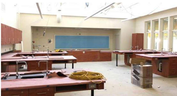
Classroom Finishes Area E 2nd Floor Science Rooms