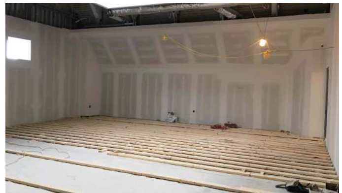
Wood Floor Installation Area G Vocal Level