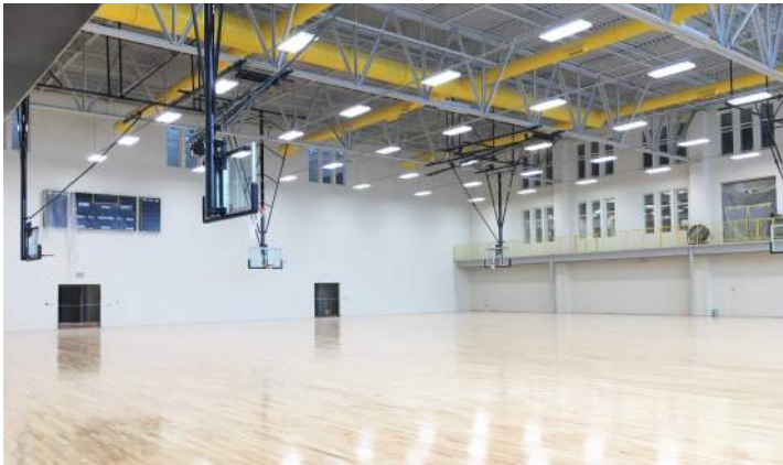
Wood Floor Finishing Area C Competition Gym