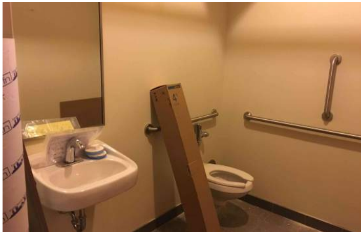
Bathroom Accessories Installation on Area A Cedar Level