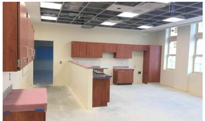
Casework Installation Area A Cedar Level