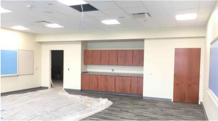
Wall Base Installation Area A 3rd Floor