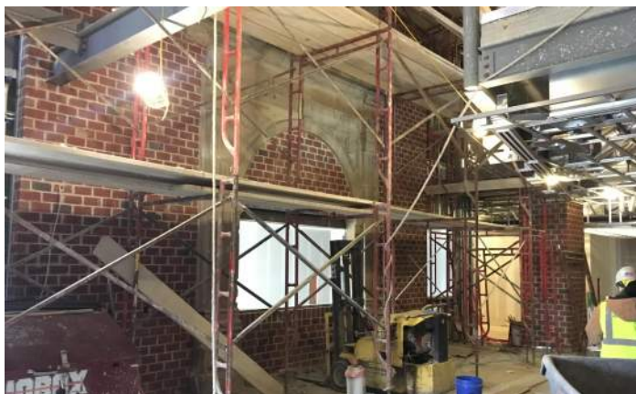
Interior Veneer Stone Installation Area F Atrium