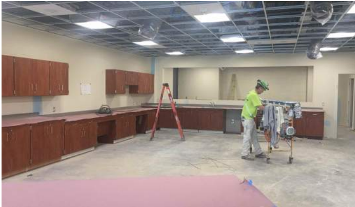
Casework Installation Area C 2nd Floor