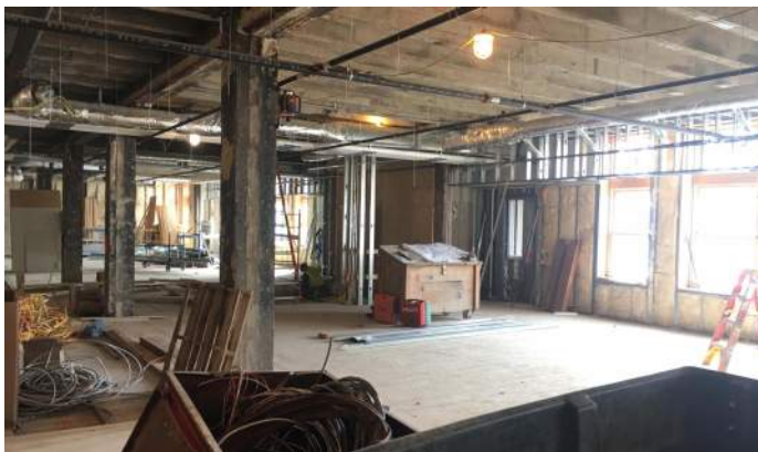
Cauffered Ceiling Installation Area G Cedar Level