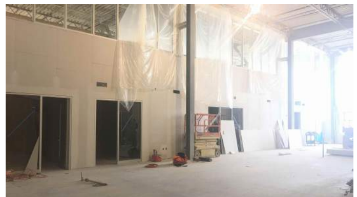
Storefront Installation Area E Cedar Level