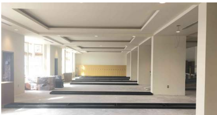
Locker Installation Area G 3rd Floor