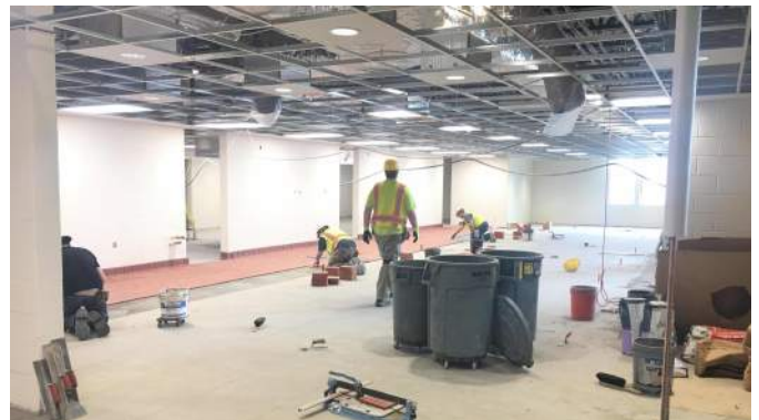
Quarry Tile Installation Area D Kitchen