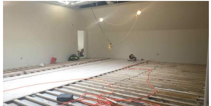
Wood Floor Installation Area G 4th Floor