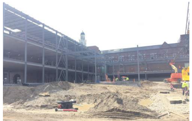
Area E structural steel in progress