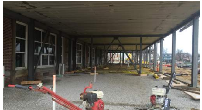
Area F Cedar Level being prepped for slab on grade