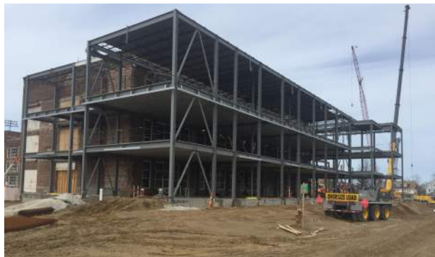
Area F structural steel