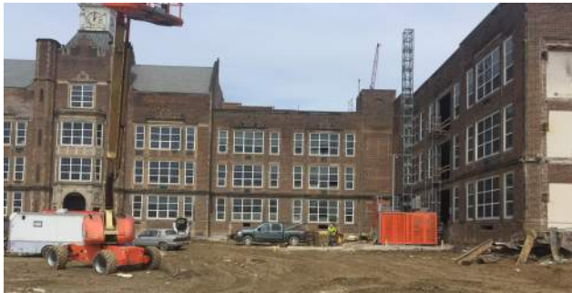
Courtyard showing the buck hoist that will be used to load material in the building