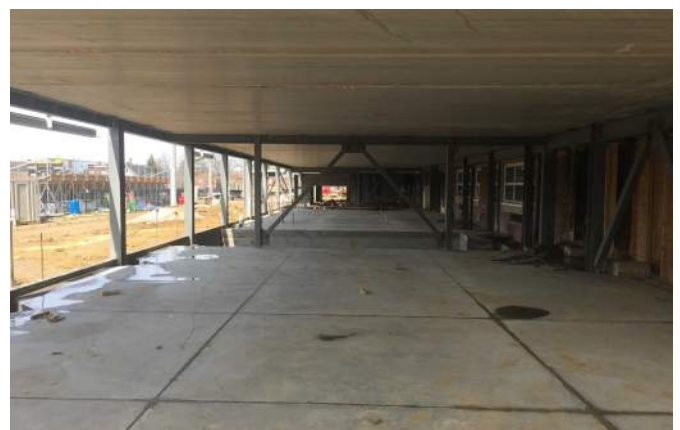
Area A Washington Level slab on grade poured