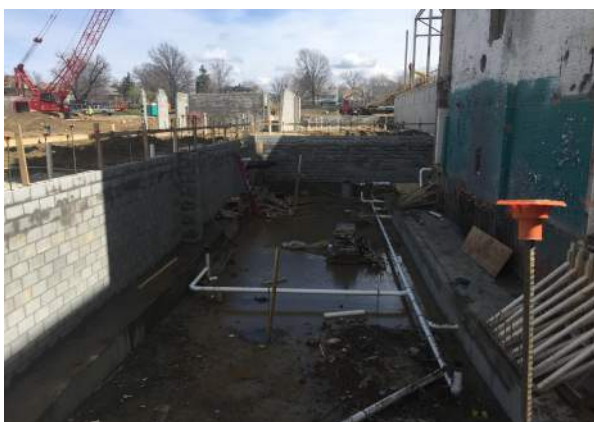
Area C Mechanical Room