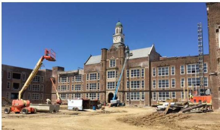
Courtyard Masonry Restoration & Buckhoist Deck Installation