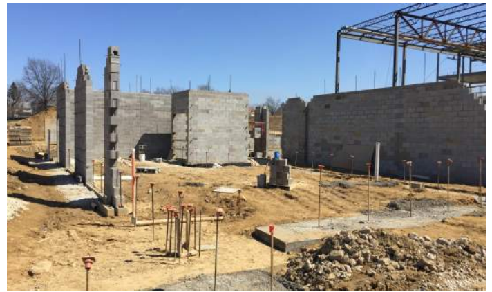
Area D Masonry