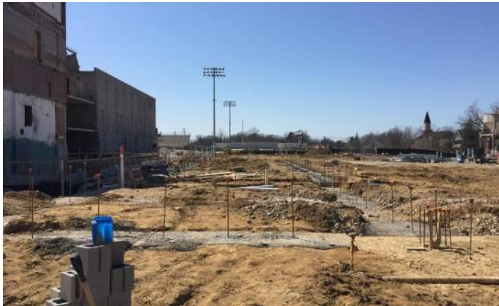
Area C Footers