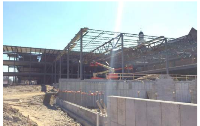
Area E Structural Steel & Bar Joists