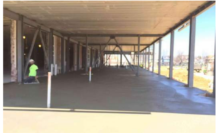
Area F Cedar Level Slab On Grade