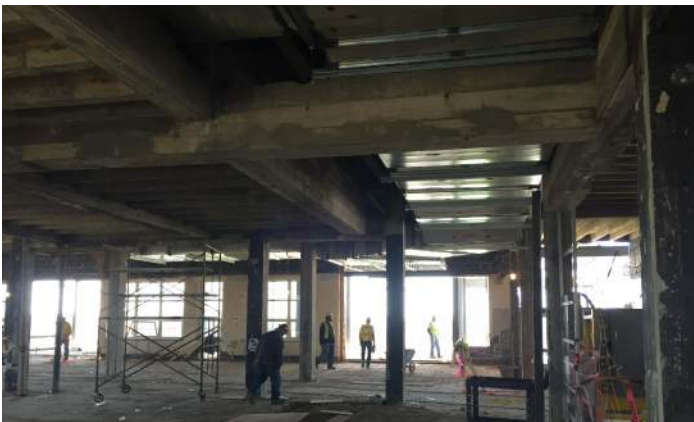
Area A Third Level Ductwork Installation