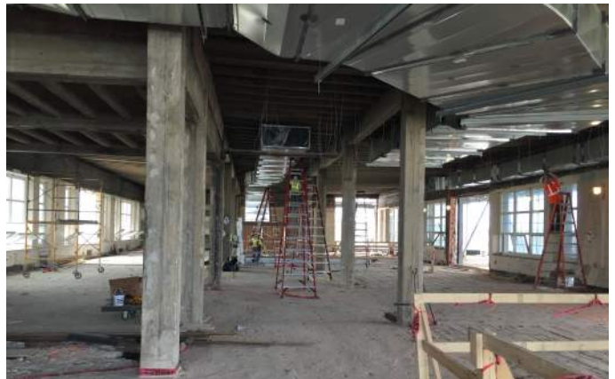
Area A 3rd Floor ductwork installation