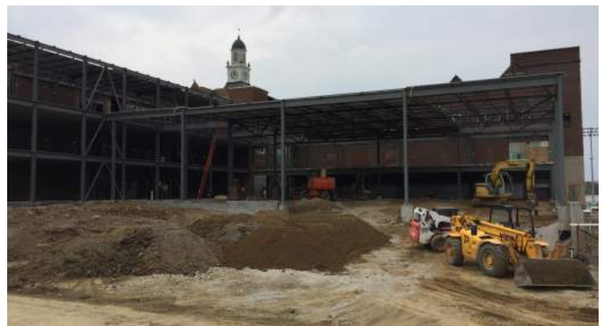
Area E roof decking & fire main underground being backfilled