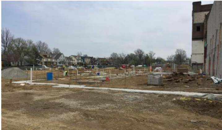
Area C footers