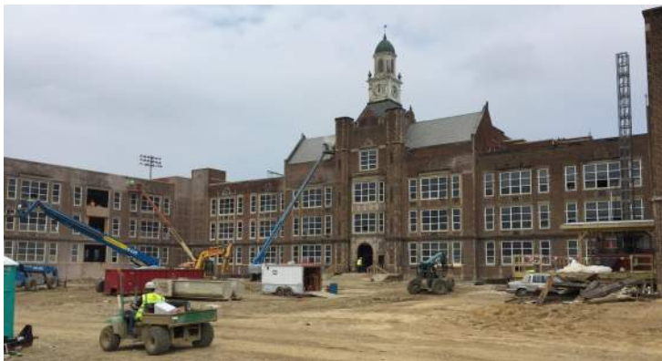
Courtyard masonry restoration & buck hoist construction