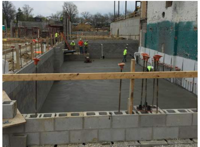
Area C Washington level Mechanical Room slab on grade poured