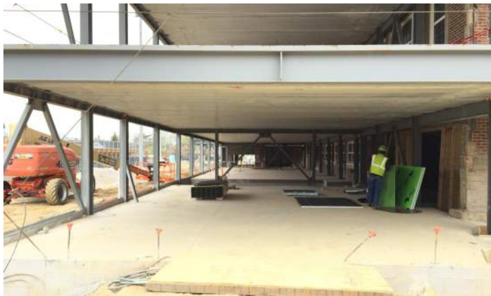
Area A Washington level exterior studs starting