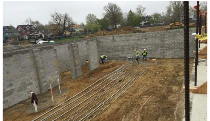
Electrical underground in Area D