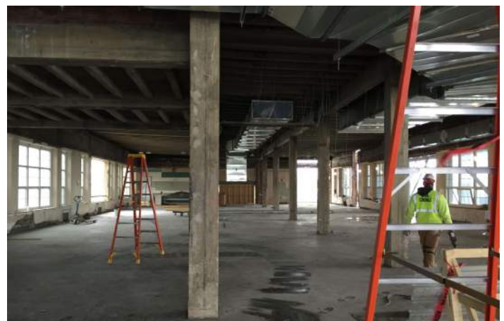
Area A 3rd floor topping slab