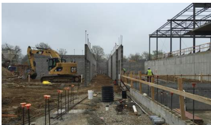
Masonry walls in Area D Washington level