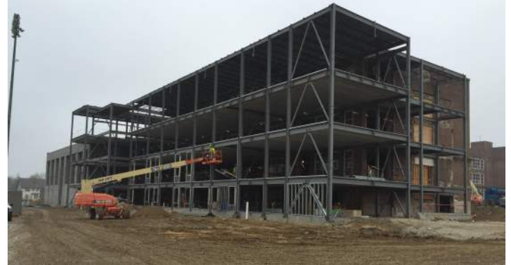
Exterior stud framing in Area A Washington & Cedar level