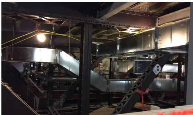
Area G 4th floor ductwork