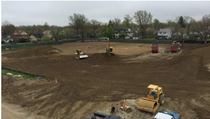
Baseball field topsoil stripping & stockpiling