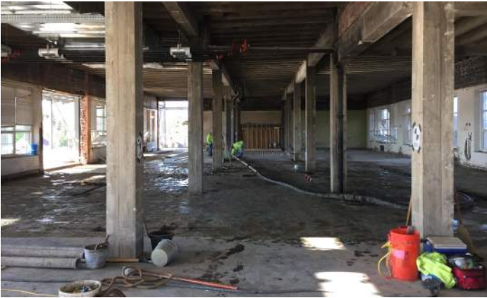
Area A Topping Slab Placement