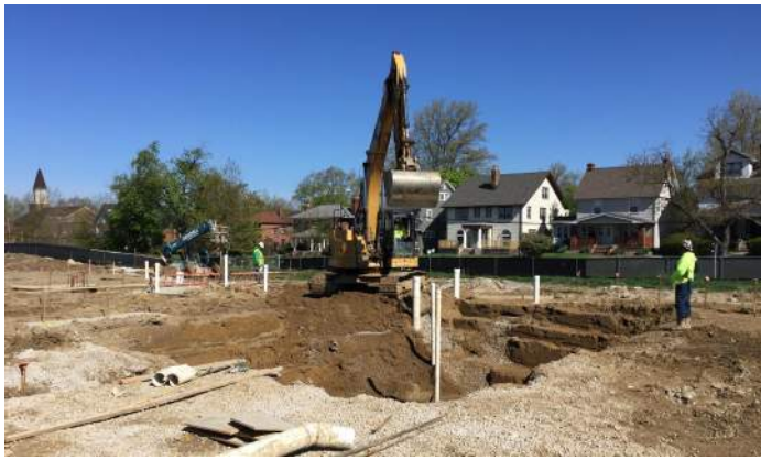
Area C Pool Surge Tank Excavation