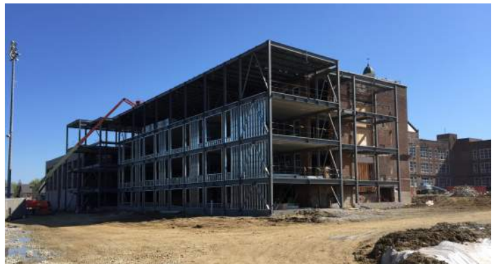
Area A Exterior Studs