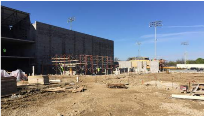
Area C Masonry Walls