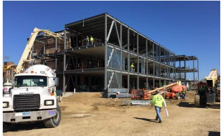
Area F Exterior Studs