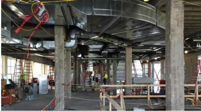
Area A 3rd Floor HVAC Ductwork & Piping