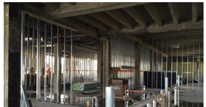
Area F Interior Studs