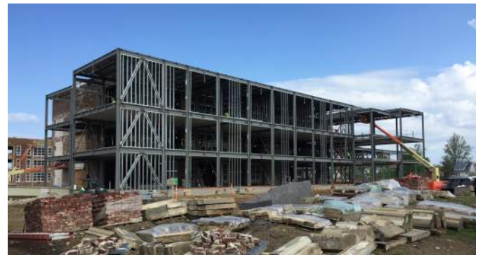
Area A F Exterior Studs