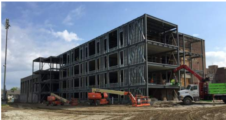
Area A Exterior Studs