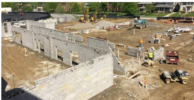
Area C Washington Level (West)