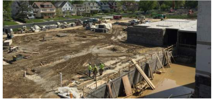
Area C Washington Level (East)