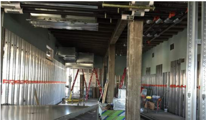
Drywall Tops of Wall 3rd Floor Area F