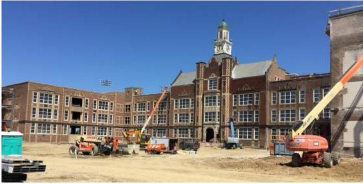
Courtyard Masonry Restoration