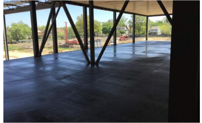
Topping Slab Pour 2nd Floor Area F