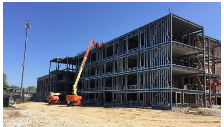
Parapet Framing Area A