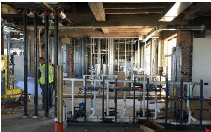
Sanitary Piping 3rd Floor Area A