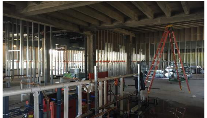
Interior Framing 3rd Floor Area F