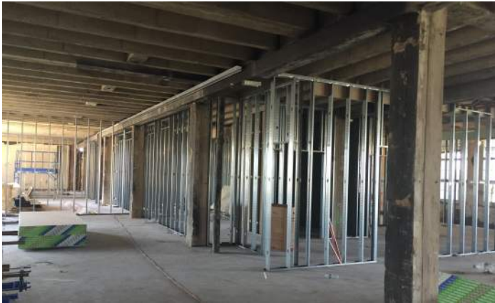
Area F 3rd Floor Stud Framing