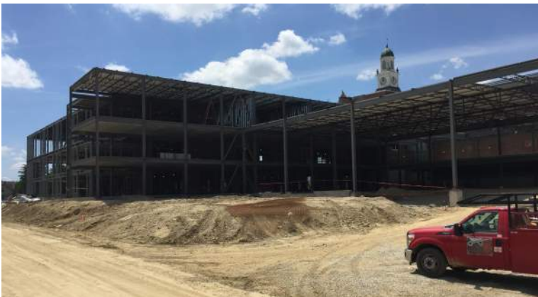
Area E & F Structural Steel