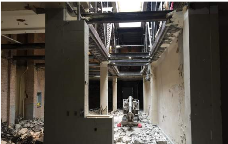
Area G 3.5 Level Auditorium Fly Loft Demo