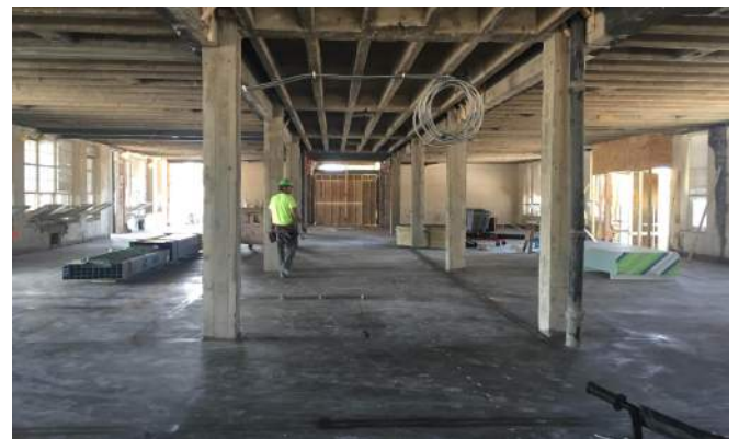
Area F 2nd Floor Interior Framing Layout