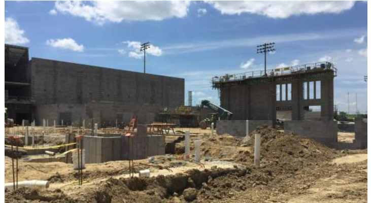
Area C Masonry Walls