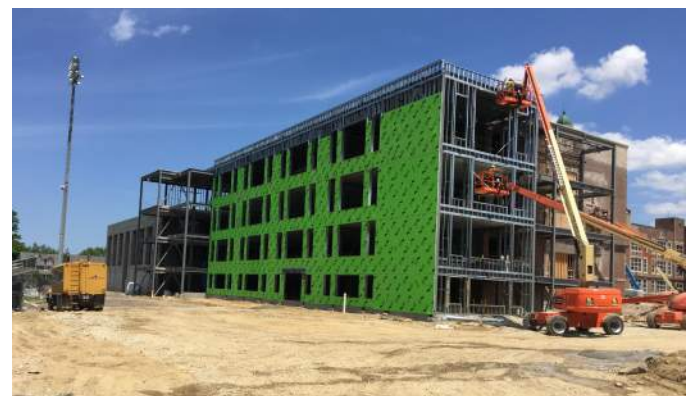
Area A Exterior Sheathing