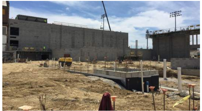
Masonry in Area C