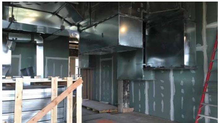
Electrical/Mechanical room drywall finishing