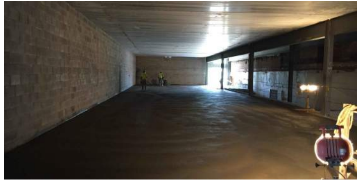
Slab on grade in Area A Cedar level