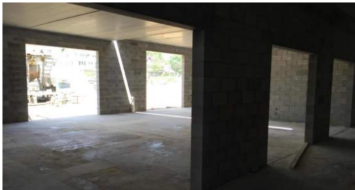
Slab on grade in Area D Washington level