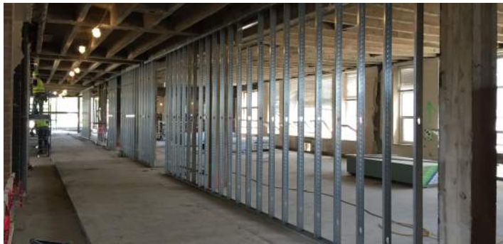
Interior stud framing in Area A & G 2nd floor