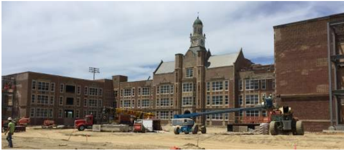
Courtyard restoration in progress