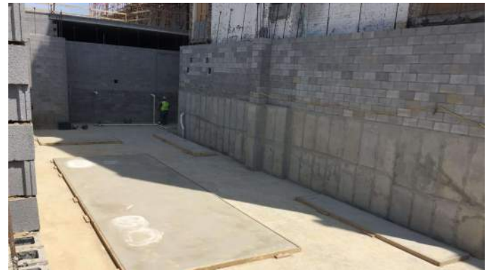
Area C Washington Level Mechanical Room Equipment Pads