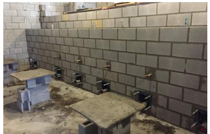
Area A 3rd Floor Bathroom Masonry