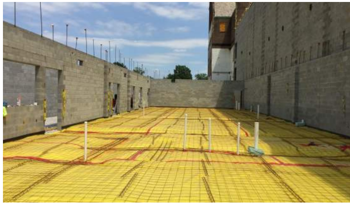
Area C Prep for Slab-On-Grade Pour