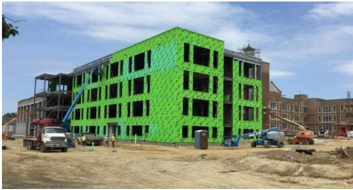
Area A Exterior Sheathing