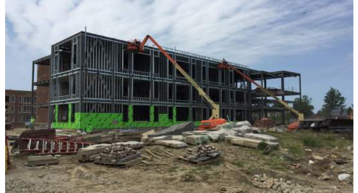
Area F Exterior Sheathing