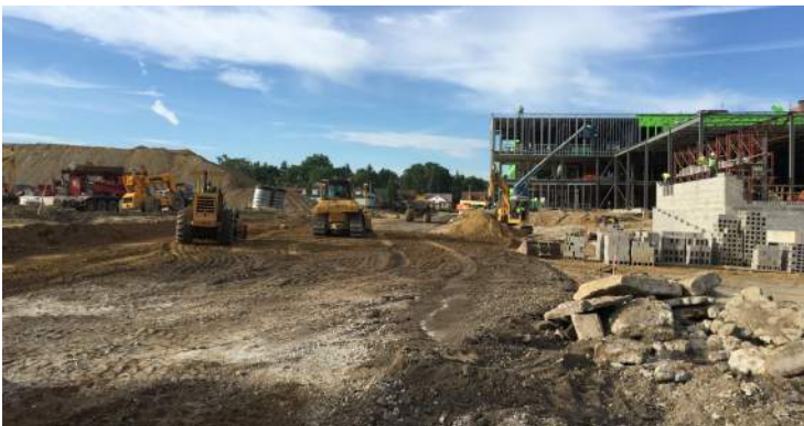
Grading East Roadway