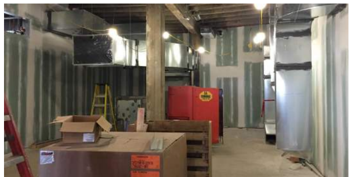
Prep Mechanical Rooms for Paint