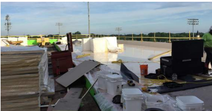
New Roofing Area A North