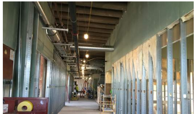
Sprinkler Piping Third Floor Area A