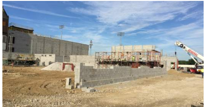
Masonry Walls Area C Washington Level