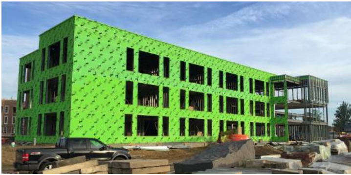
Exterior Sheathing Area F East Elevation