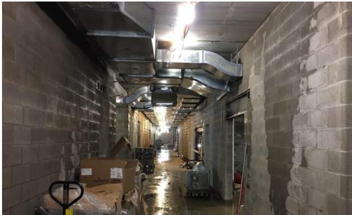
HVAC & HVAC Pipe Hangers