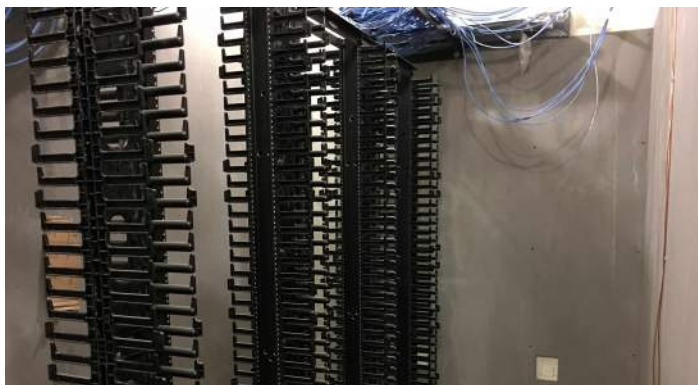
Area A 3rd Floor Data Room