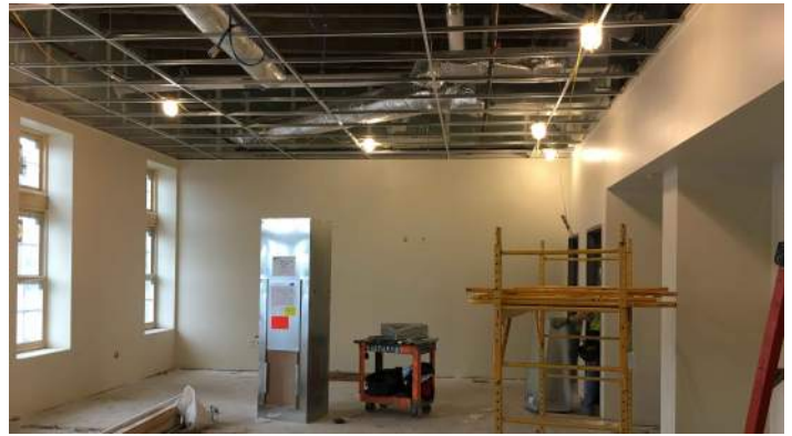
Mock-Up Room Painting & Ceiling Grid