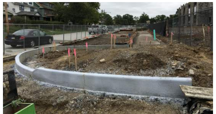
Curbs & Sidewalk Prep Work