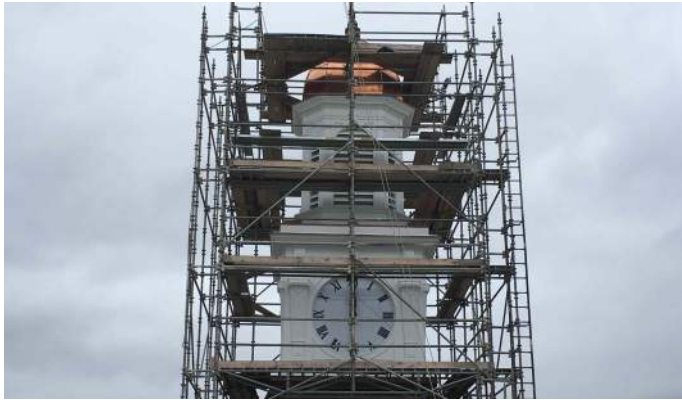
Clock Tower Restoration