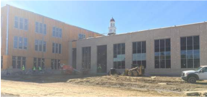
Veneer Stone & Window Installation Areas E & F