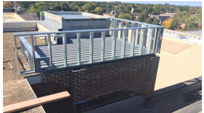
Rebuilding Parapet Area A Roof