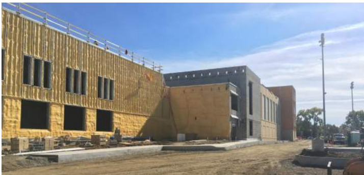
Curbs, Sidewalks & Frost Slabs West Drive