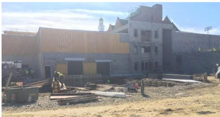
Loading Dock Retaining Wall Construction Area D