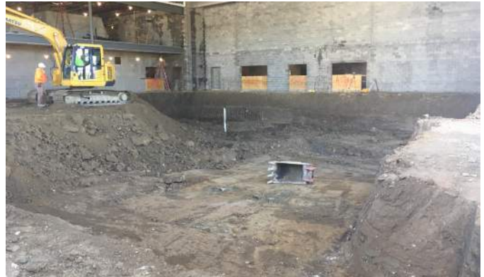
Pool Excavation Area C Washington Level