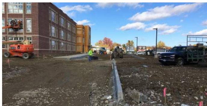
East Drive Curbs & Sidewalks Installations