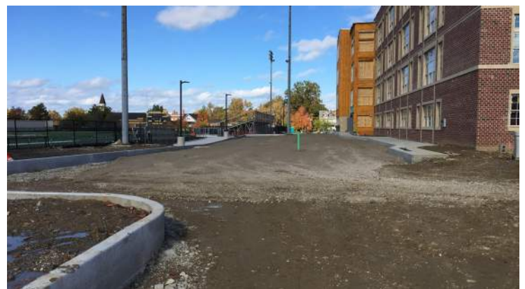
West Drive Prep for Asphalt Pavement