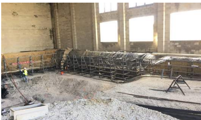
Area C Washington Level Natatorium Construction