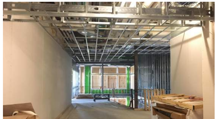
Area A & F Corridor & Atrium Ceilings