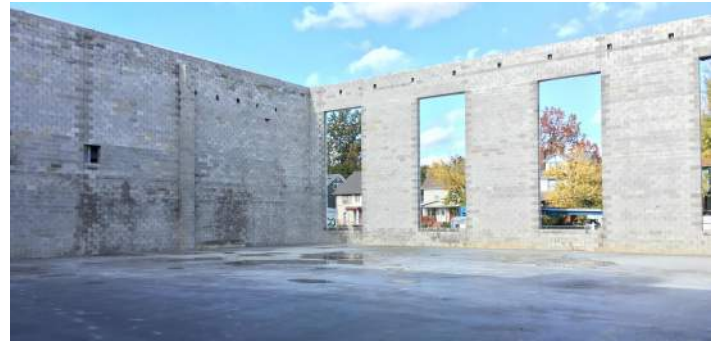
Area C Auxiliary Gym Slab-On-Grade Poured