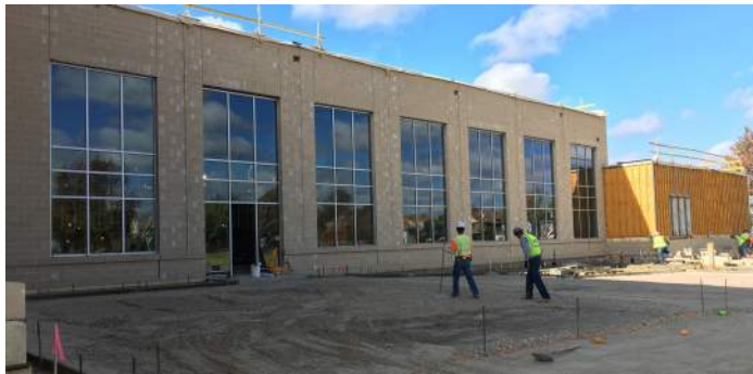
Area E Outdoor Plaza Prep for Slab-On-Grade