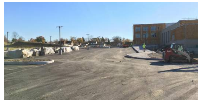
Asphalt Paving Intermediate Course on East Road