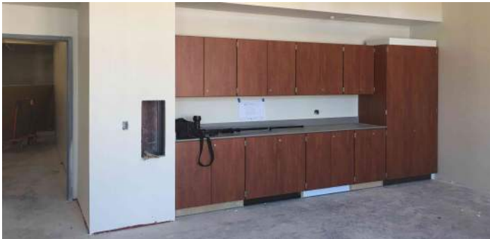
Casework Installation in Area A 3rd Floor