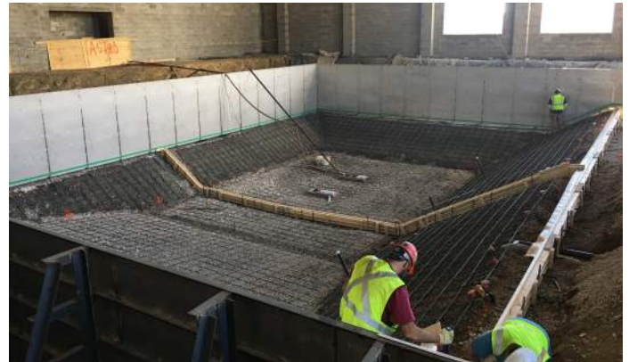
Prep for Pool Concrete Floor in Area C Washington Level