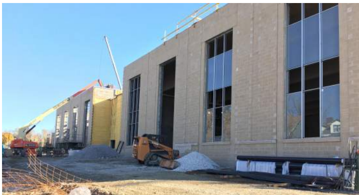
Cast Stone Veneer on Area C North Elevation