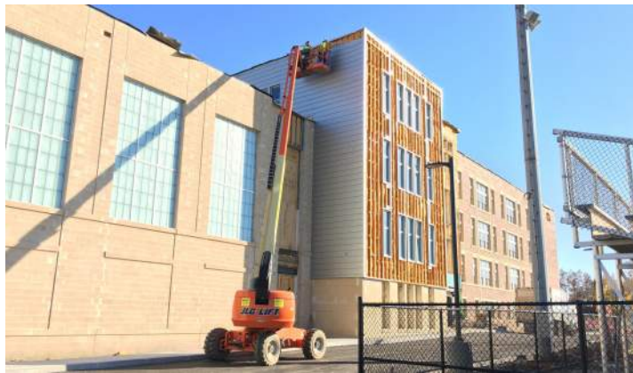
Metal Panel Veneer on Area A North Elevation