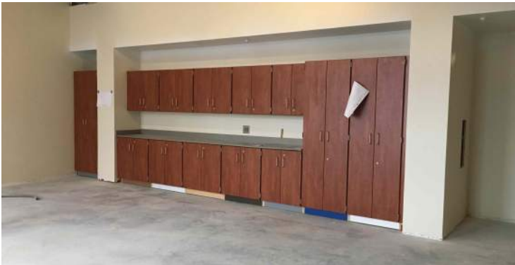
Area A 3rd Floor Casework Installation