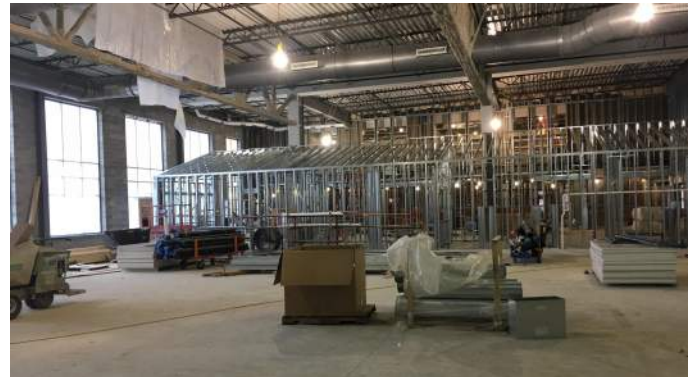
Area E Cedar Level Metal Stud Framing