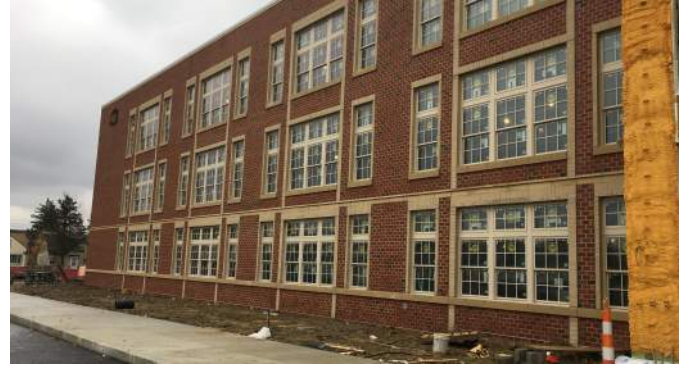
Area F East Elevation Masonry Cleaning