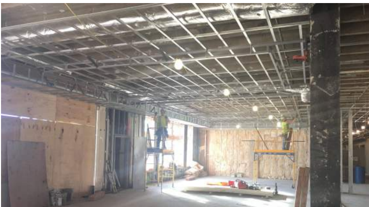
Area G 3rd Floor Vaulted Ceiling Framing