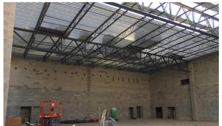
Area C Washington Level Auxiliary Gym Metal Roof Decking