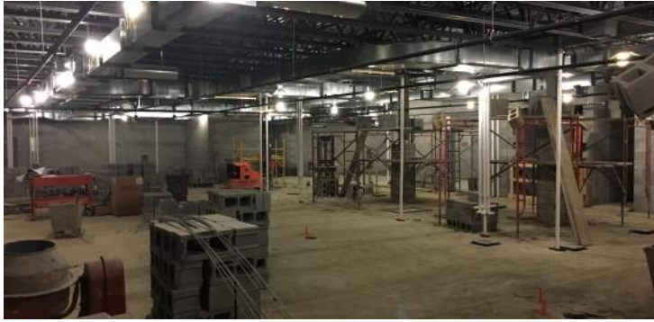
Area D Cedar Level MEP Rough-In