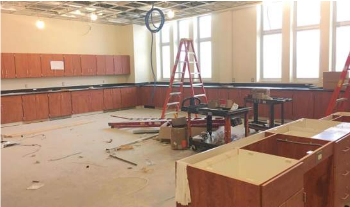
Area A 3rd Floor Casework Installation