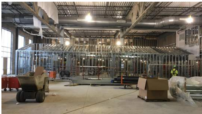
Area F Cedar Level Framing & MEP Installation