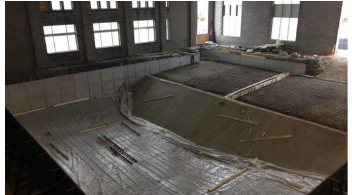
Area C Washington Level Pool Floor Prep