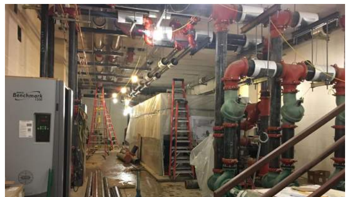
Area C Washington Level Mechanical Room C032