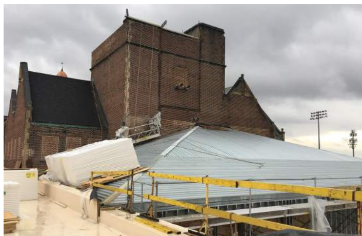
Area C Gable Roof Installation