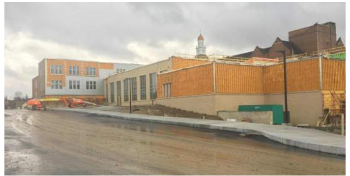
Area D, E & F East & North Elevation