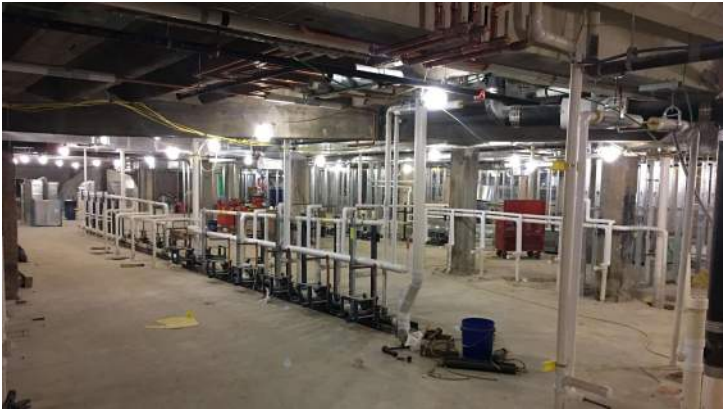
Area A Washington MEP Rough-In