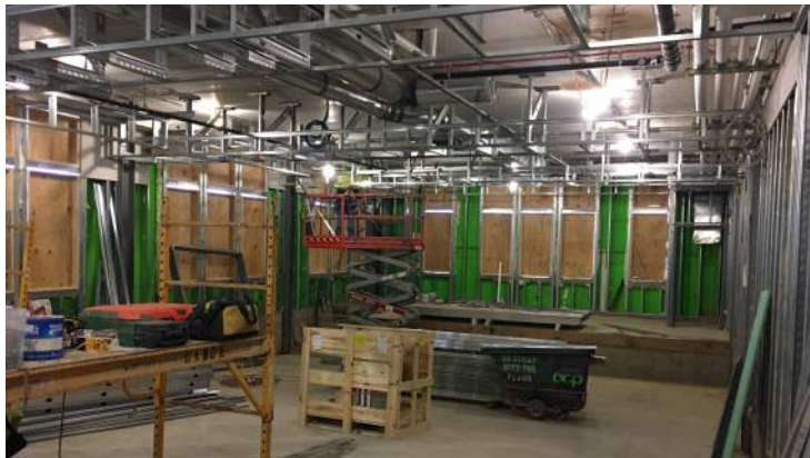
Area F Cedar Level Mini Auditorium Framing