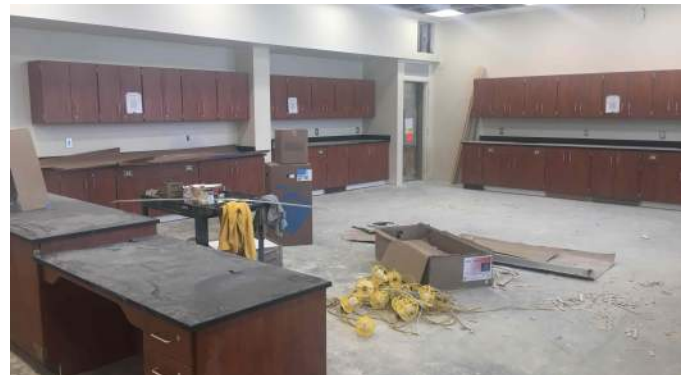
Area A 3rd Floor Casework Installation