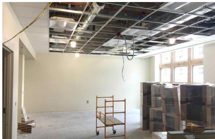
Area A 2nd Floor Ceiling, Lights, Speaker & Sprinkler Installation