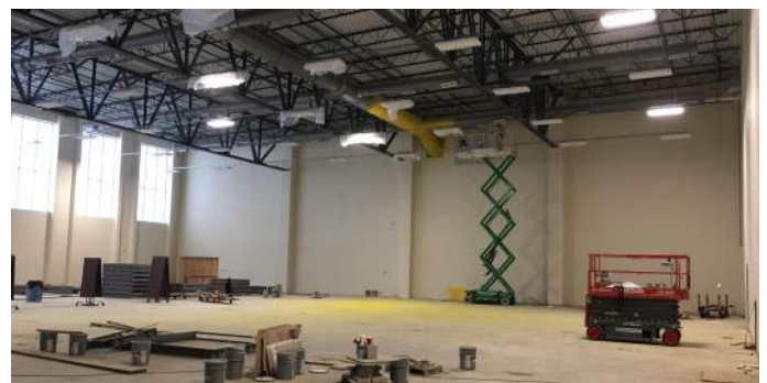
Competition Gym Spiral Duct Painting