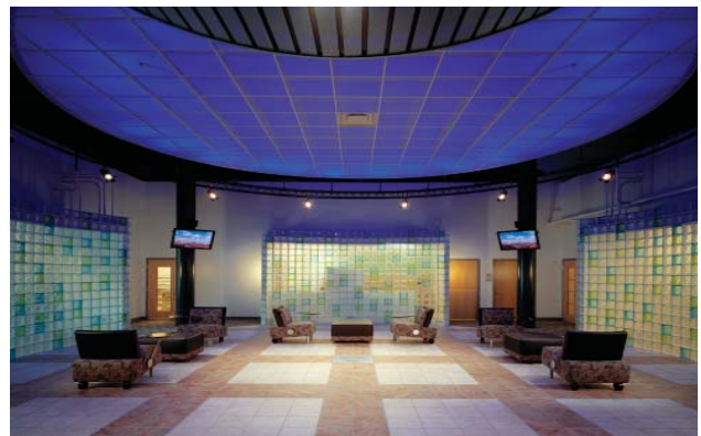
Auburn Career Center

Another unique aspect of SCG is its ten year relationship with Blundall Associates, Inc. Acting as an extension of our staff, the support of this professional estimating firm ensures accurate and on-time estimates.