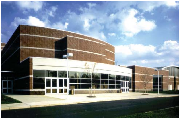
Green Local School District

SCG's approach to working with an independent facility master planning consultant is to become completely immersed in the planning process in order to provide comprehensive data to the planning team as needed throughout the planning process. We see this happening through the following process: