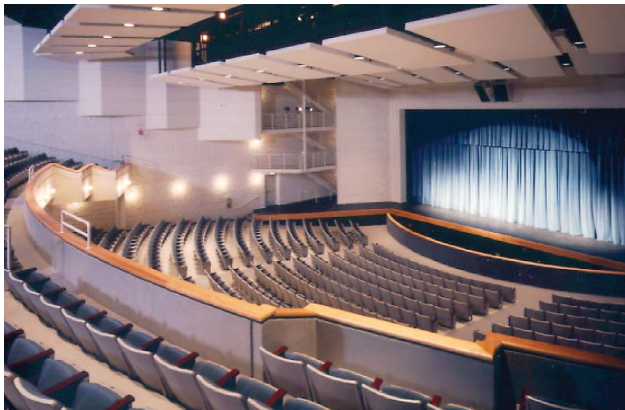
Wooster City School District

With these steps taken, the Planning Team will be poised to progress immediately through the planning process upon passage of the operating levy. To assure meeting our milestones within the planning process, SCG will dedicate all necessary resources so that we can offer continual feedback to the rest of the planning team. In addition to the primary team member identified in this document, SCG has a bench-strength of 40 construction professionals