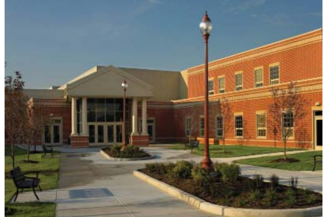
Warren City School District

We have also included the resumes of other proposed key staff for the Cleveland Heights - University Heights City School District project.