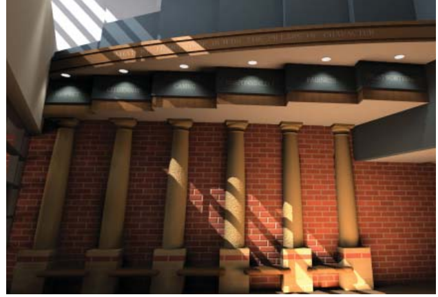
Austintown Local School District

SCG takes great pride in having provided services for over 50 local school districts worth over $1.6 billion. (For a complete list of local projects please see page 2 of this proposal) SCG staff approaches each school facility project professionally as well as personally, since their own children attend the very schools that they manage. This local participation gives us unique insight into the complexities and potential pitfalls for school facilities and drives us to make sure that each project is a success. SCG's local experience is unmatched and we look forward to putting that experience to work for the Cleveland Heights – University Heights City School District.