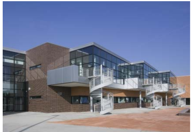
Plain Local Schools

The final plan, on which construction was completed in 2003, included a complete re-districting and revised grade alignment eliminating "neighborhood" elementary schools for horizontally arranged grade-specific buildings dedicated to the north and south regions of the district. Each region also included a kindergarten center which included pre-k, not previously provided by the district. Every building in the district received renovations, and/or additions to meet the new program requirements as well as ADA and building system improvements.