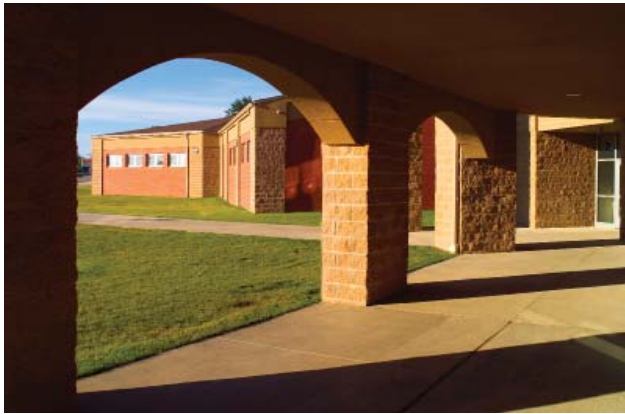
Tuslaw Local School District

SCG began focusing on building “green” more than twelve years ago by incorporating high efficiency fixture ballasts and an energy management system in the Green Local School District. Since then, our knowledge of sustainable solutions has grown and we now incorporate green principles into all of our projects. Also, with the emergence of LEED, everyone’s awareness has been raised, not only of the economic benefits of efficient design, but of the greater benefits to users, nature and the community. SCG includes LEED criteria in every document phase review and our early adoption of LEED standards allows us to provide a better product for the school districts we serve.