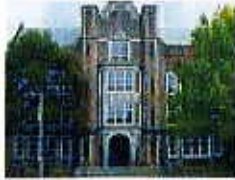
Small Schools of Heights High