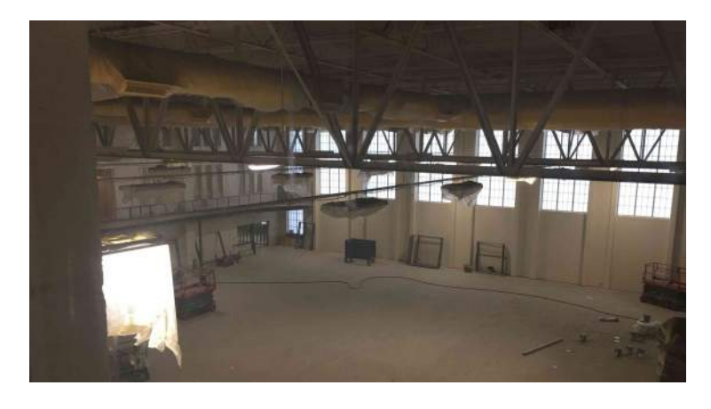
Competition Gym View from Area B Second Floor Science Classrooms