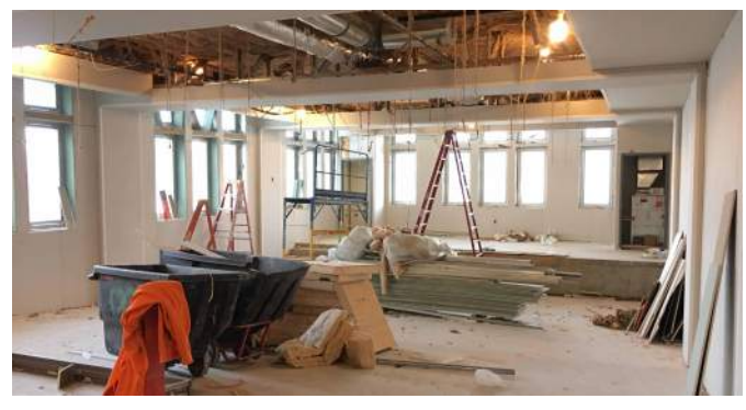
Gypsum Board Installation in Area F Cedar Level Mini Auditorium