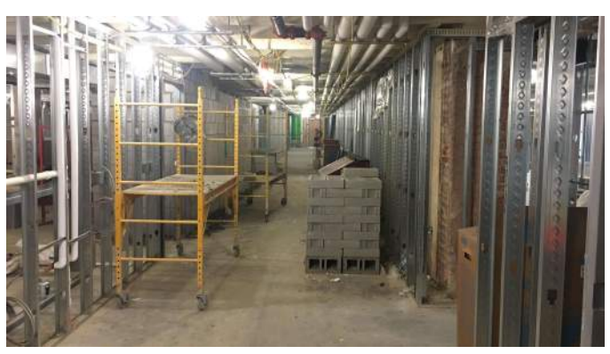
Interior Masonry Partition Walls in Area A Washington