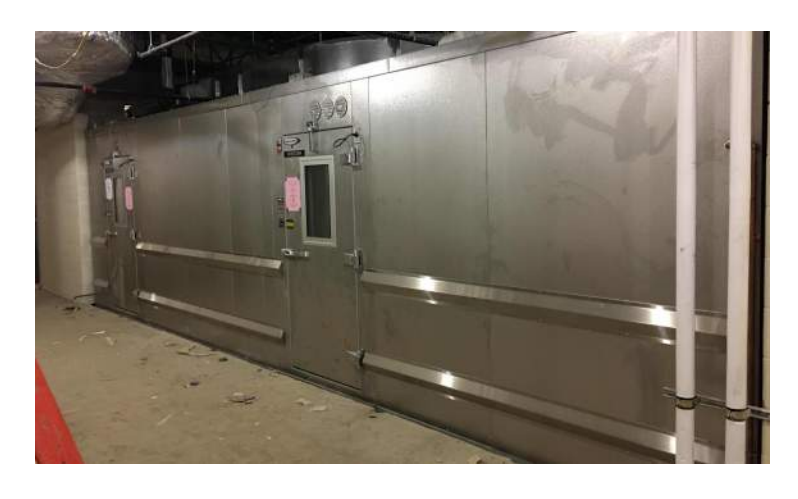
Kitchen Walk-In Coolers in Area D Cedar Level