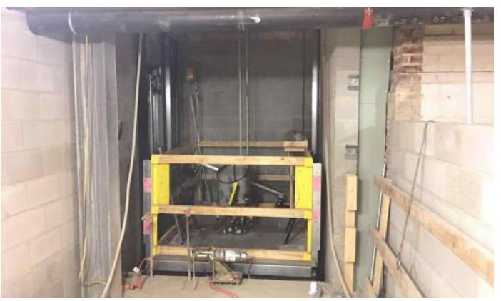
Elevator #1 Installation