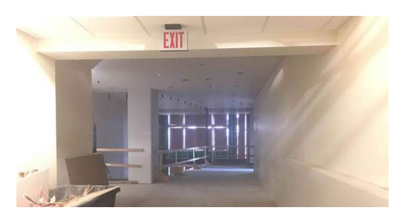
Gypsum Board Installation in Area A Atrium