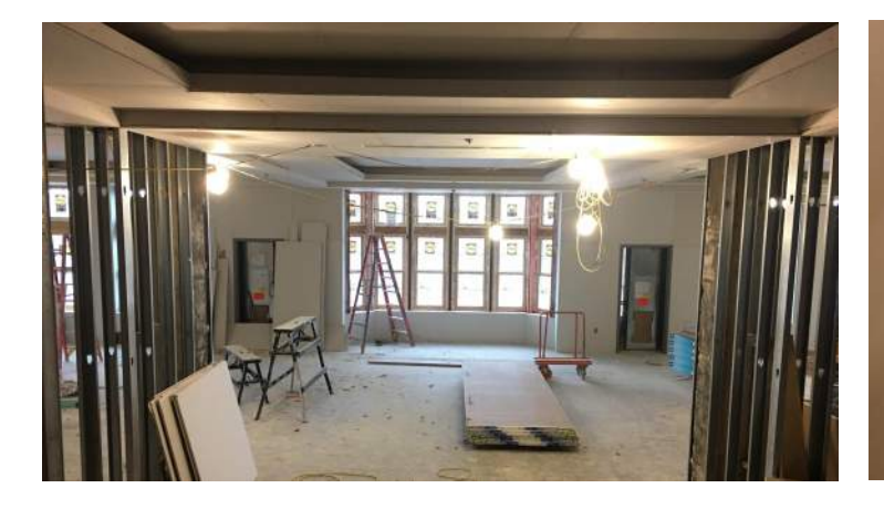
Area G 3rd Floor Locker Area Bay Windows