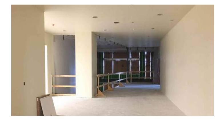
Area A 3rd Floor Atrium