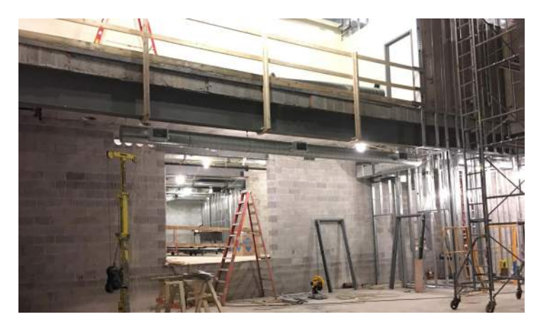
Area C Washington Level Scene Shop