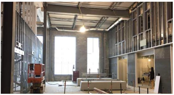
Area F Cedar Level Reading Area