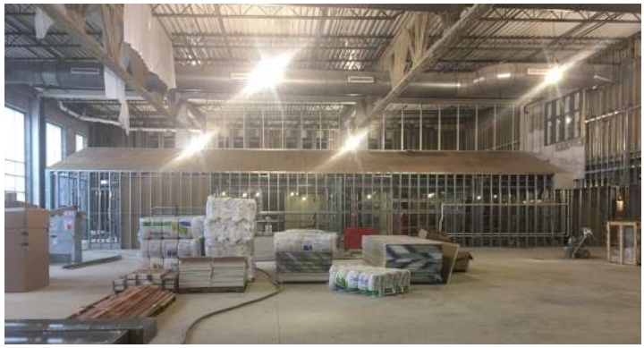
Area E Cedar Level Dining Commons