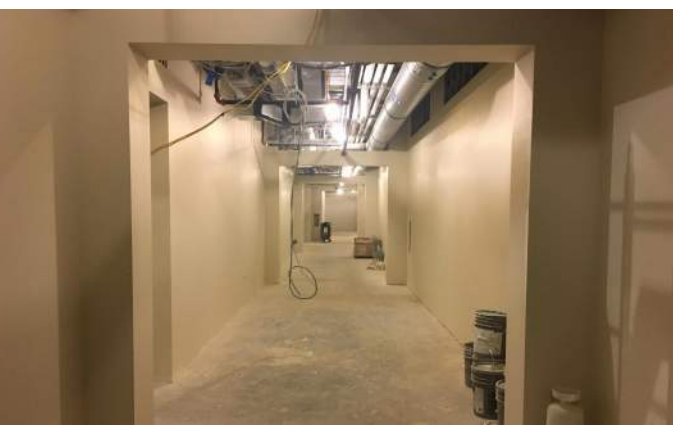
Area G 2nd Floor Science Hall