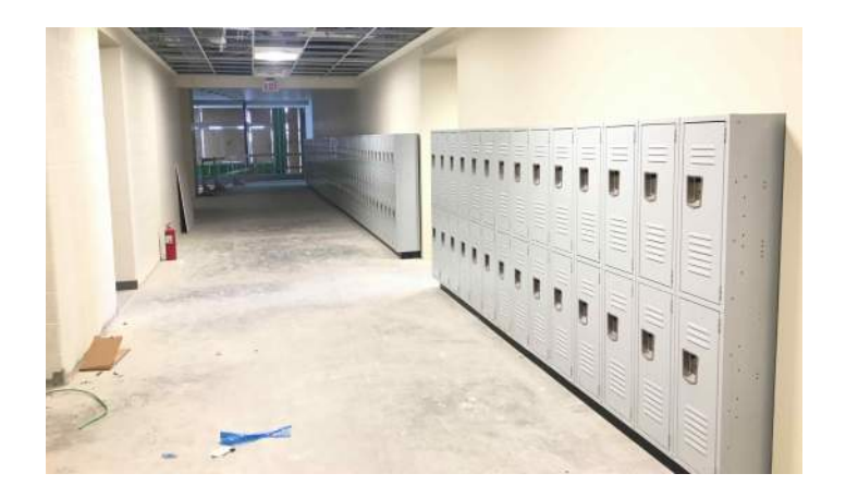
Metal locker installation on Cedar Level Area A