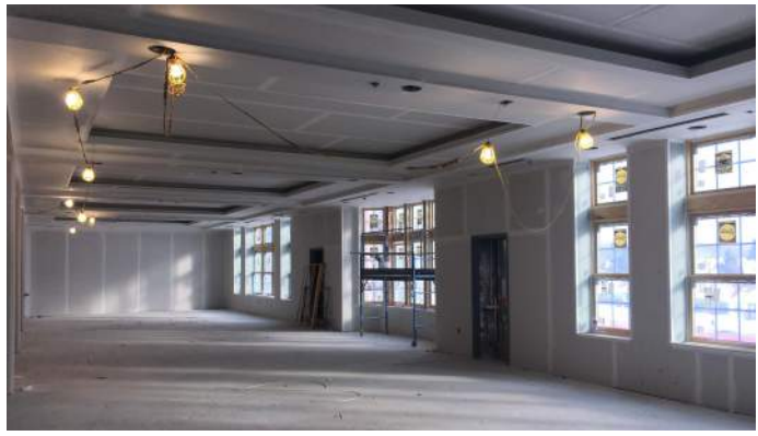
Coffered ceiling taping on 3rd floor Area G