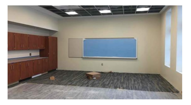
Markerboard & tackboard installation on 3rd floor Area A