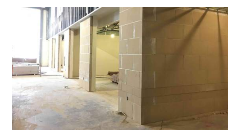
Interior stone veneer on Cedar Level Area E