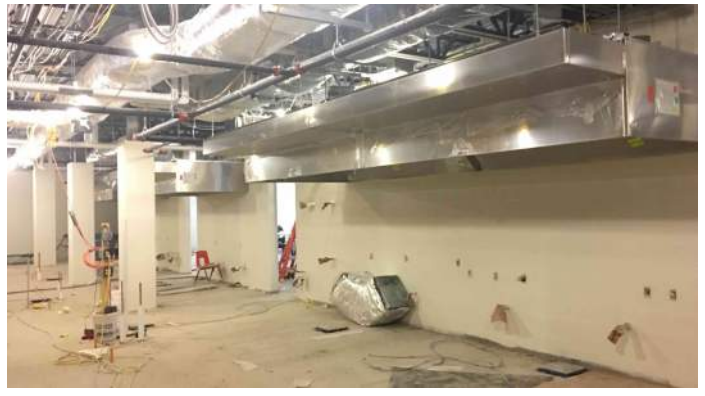
Stainless hood installation on Cedar Level Area E