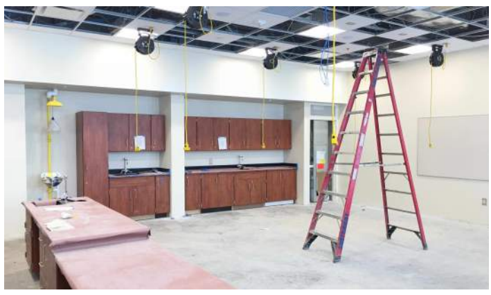
Cord Reel Installation in Area A 3rd Floor