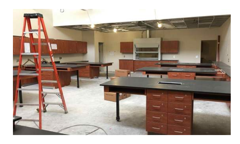
Casework Installation in Areas B & E 2nd Floor