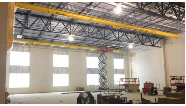
Lighting Installation in Area C Washington Level