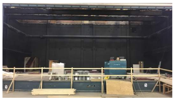
Painting Stage in Area G Cedar Level Auditorium