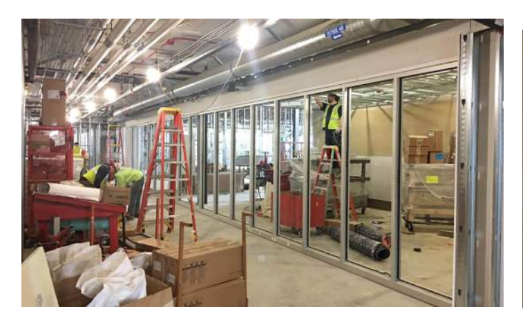
Curtain Wall Installation in Area E Cedar Level