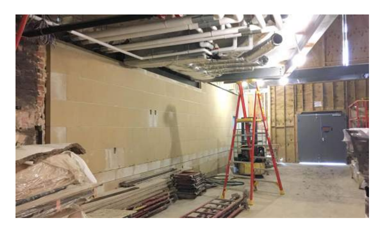
Interior Masonry Stone Veneer Installation in Area F Vestibule