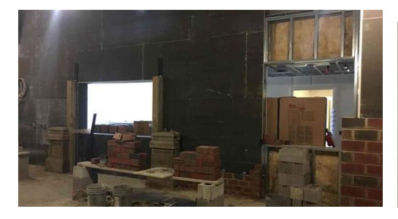
Interior Stone Veneer Area F Cedar Level