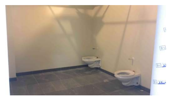
Ceramic Floor Tile Area A Cedar Level