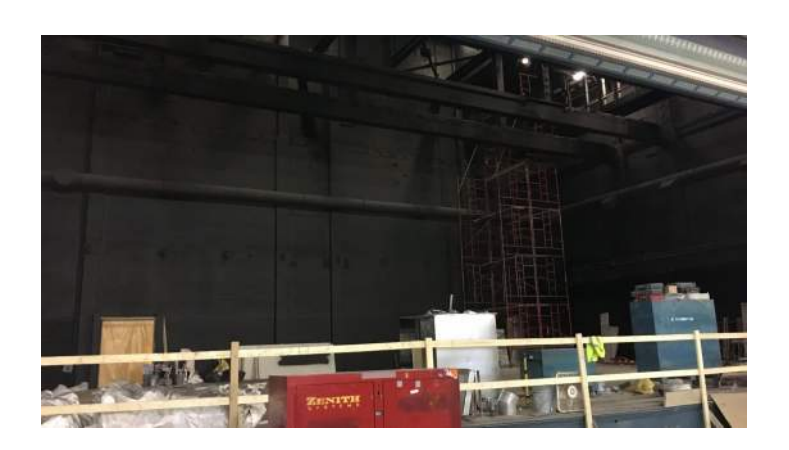
Painting Stage Walls Area G Cedar Level