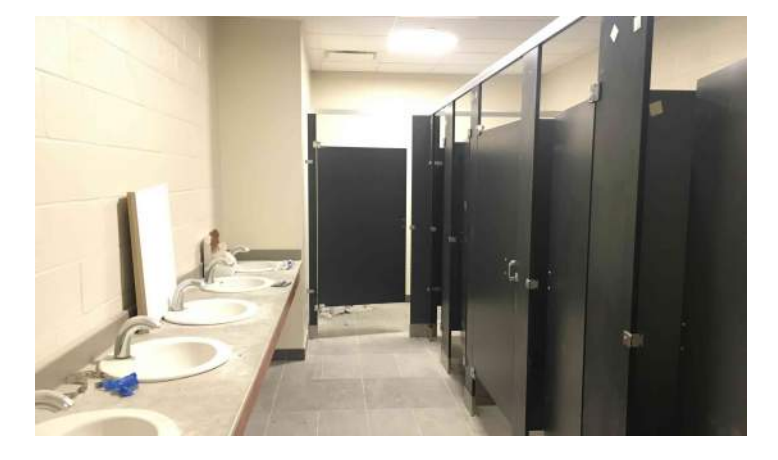
Toilet Partitions Area A 3rd Floor Bathrooms