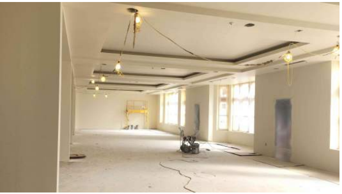
Painting Chauffeured Ceilings Area G 3rd Floor