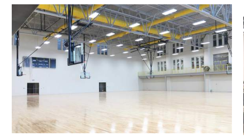
Wood Floor Finishing Area C Competition Gym