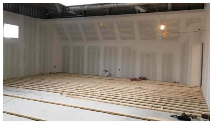
Wood Floor Installation Area G Vocal Level