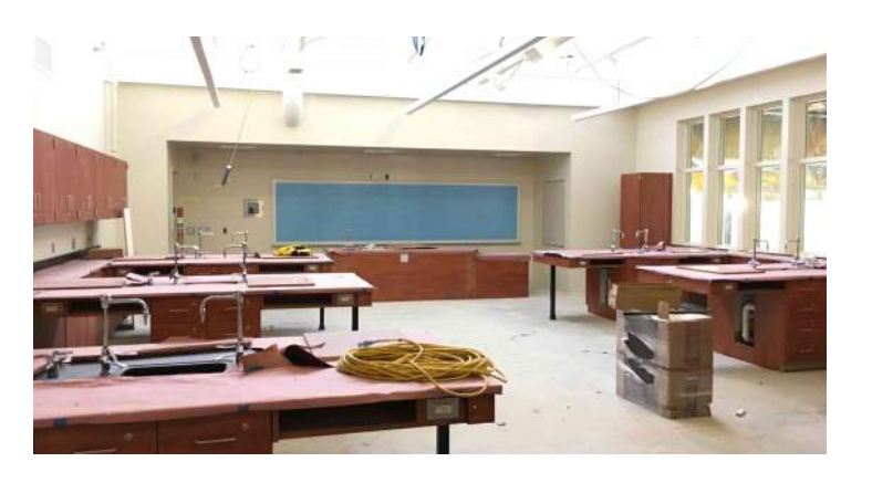
Classroom Finishes Area E 2nd Floor Science Rooms