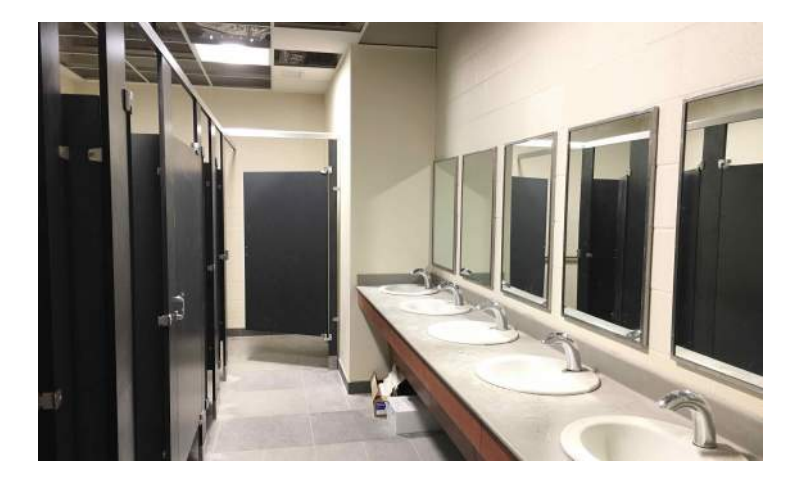
Glazing Installation 3rd Floor Bathrooms