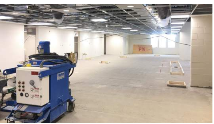
Quarry Tile Floor Prep Area D Kitchen