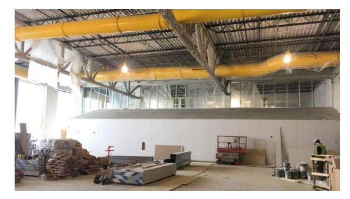
Drywall Installation Area E Dining Commons