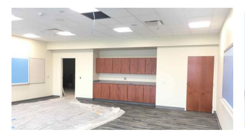
Wall Base Installation Area A 3rd Floor