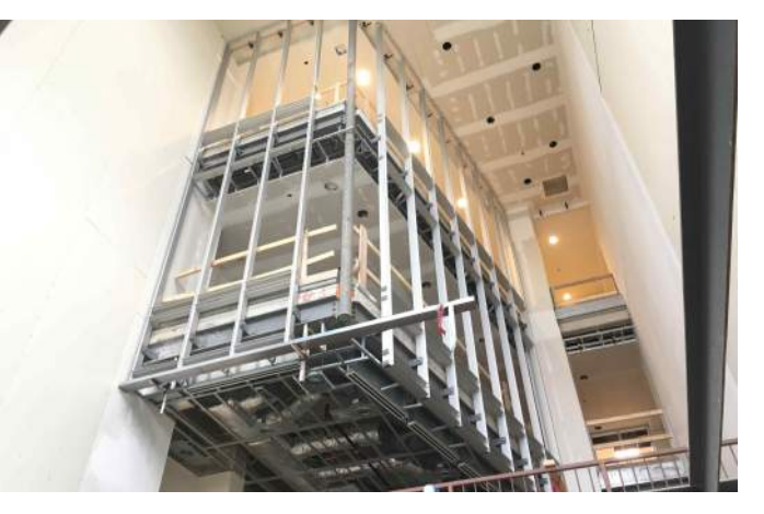
Curtainwall Installation Area A Atrium

Interior Veneer Stone Installation Area F Atrium