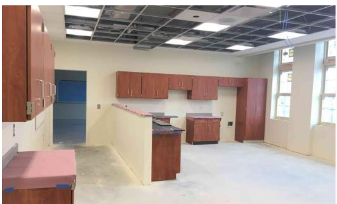
Casework Installation Area A Cedar Level