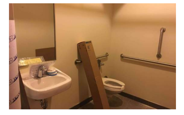
Bathroom Accessories Installation on Area A Cedar Level