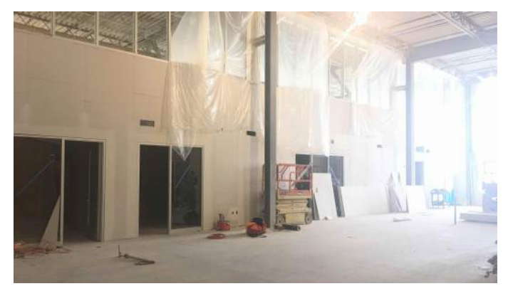
Storefront Installation Area E Cedar Level