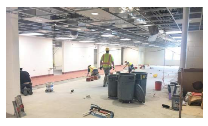
Quarry Tile Installation Area D Kitchen