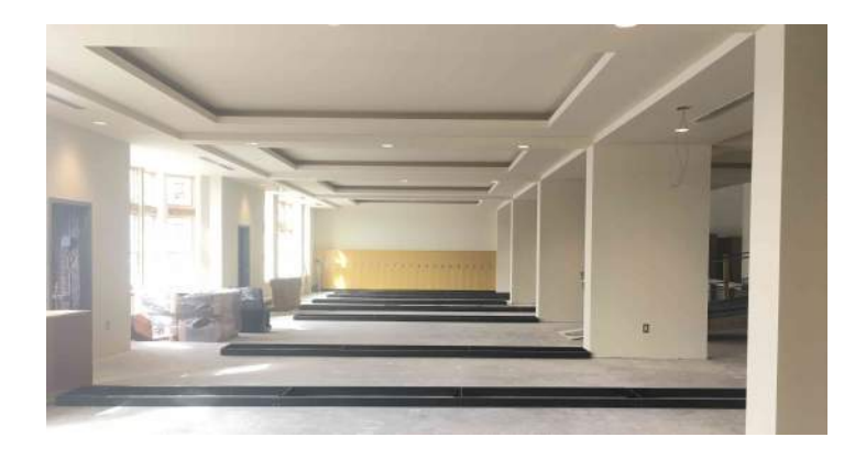
Locker Installation Area G 3rd Floor