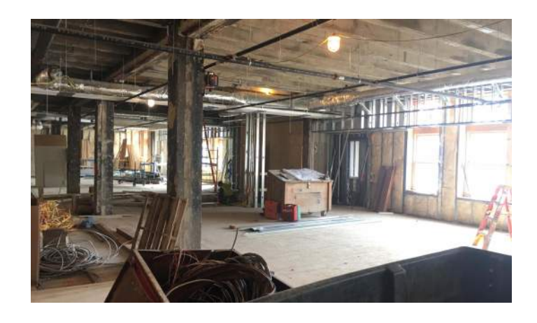
Cauffered Ceiling Installation Area G Cedar Level