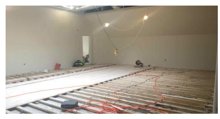
Wood Floor Installation Area G 4th Floor