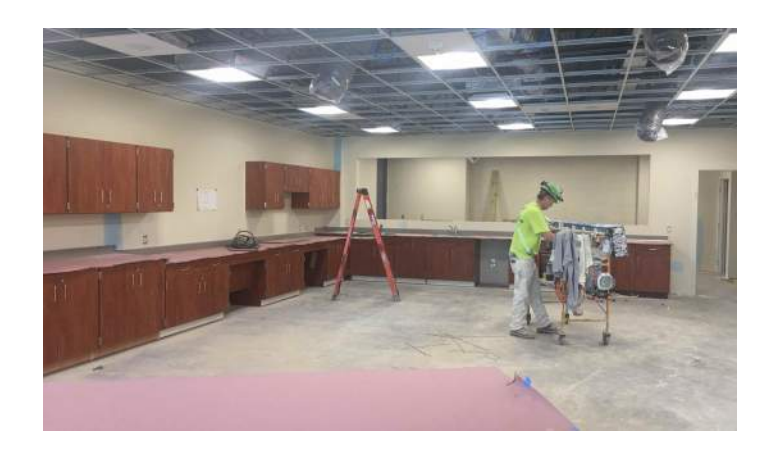
Casework Installation Area C 2nd Floor