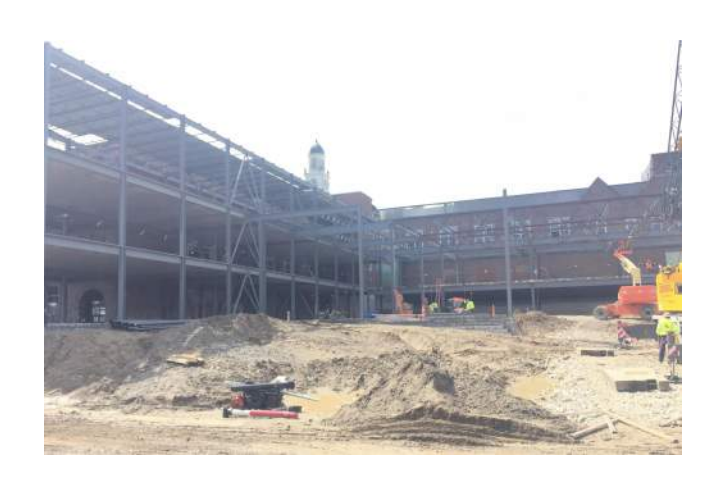
Area E structural steel in progress