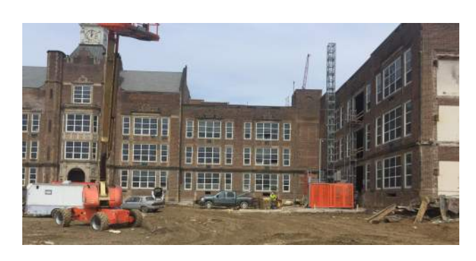
Courtyard showing the buck hoist that will be used to load material in the building