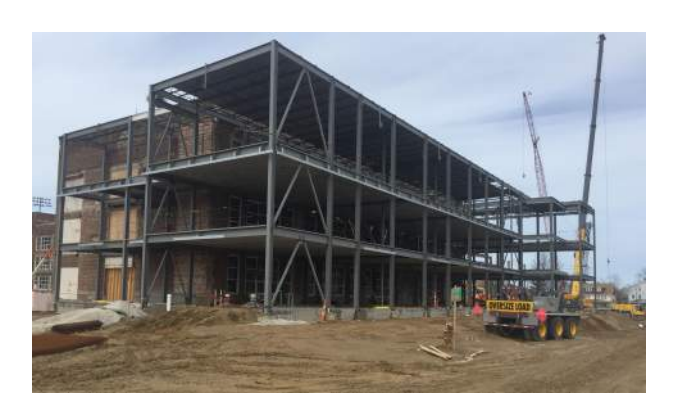
Area F structural steel