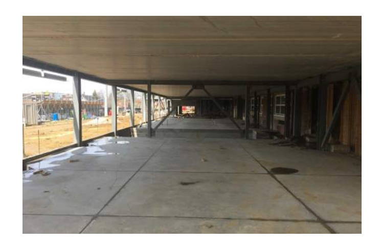
Area A Washington Level slab on grade poured