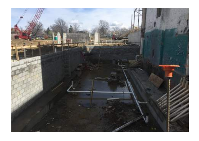
Area C Mechanical Room