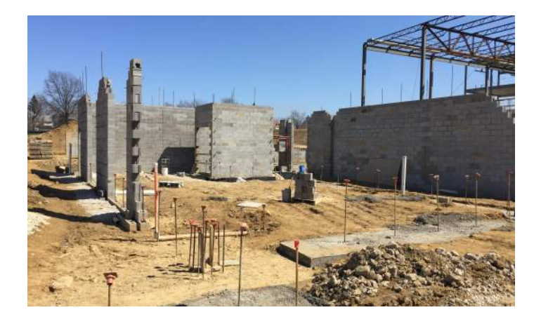
Area D Masonry