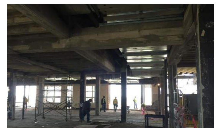
Area A Third Level Ductwork Installation