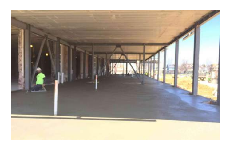
Area F Cedar Level Slab On Grade