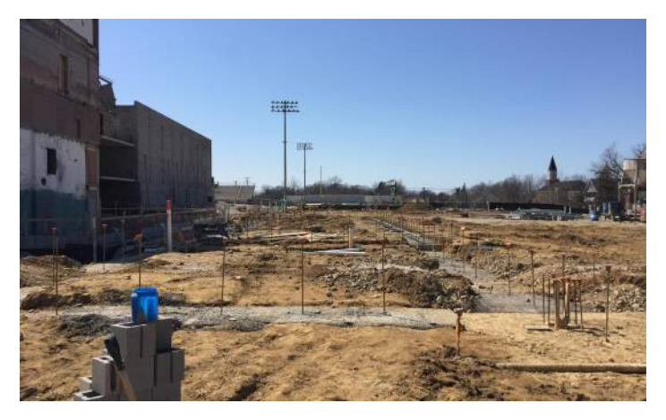
Area C Footers