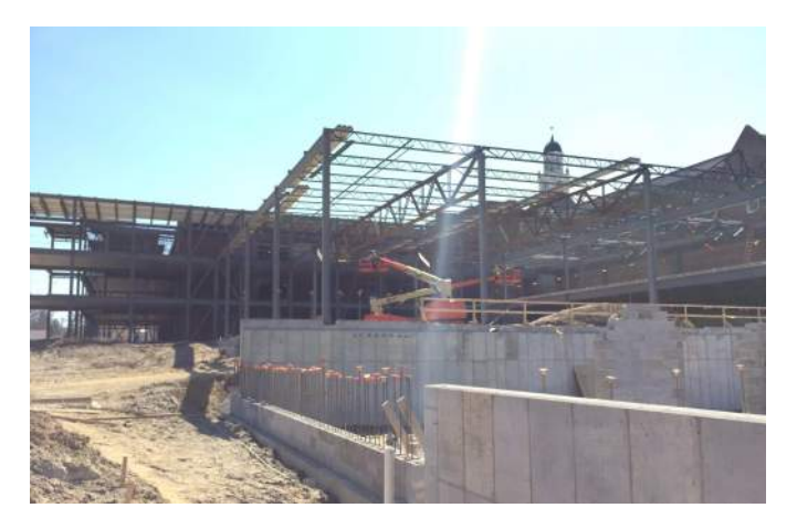
Area E Structural Steel & Bar Joists