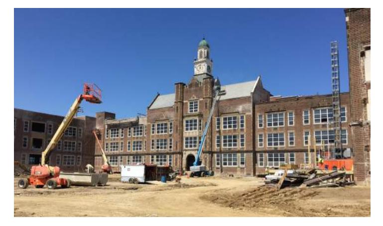
Courtyard Masonry Restoration & Buckhoist Deck Installation