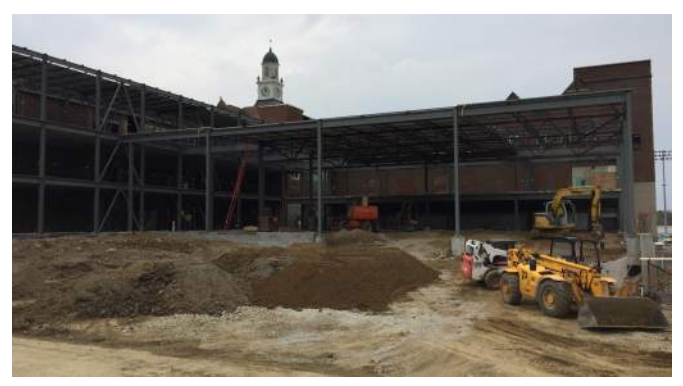
Area E roof decking & fire main underground being backfilled