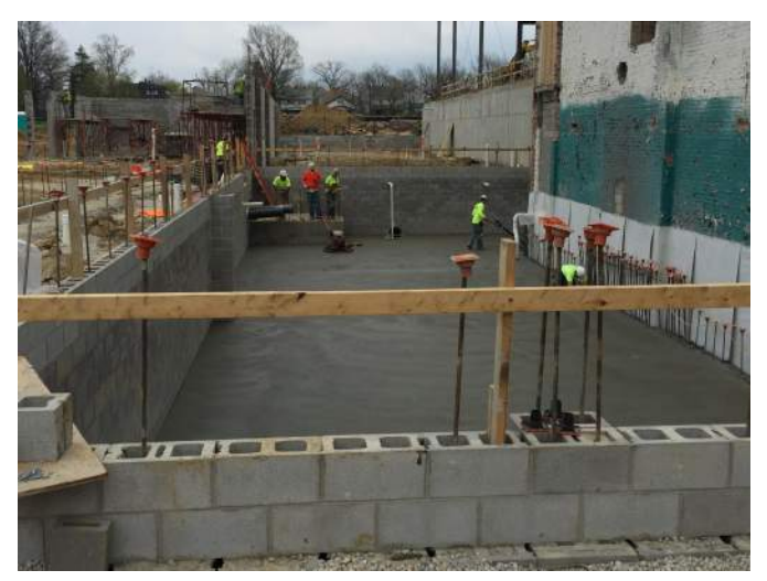
Area C Washington level Mechanical Room slab on grade poured