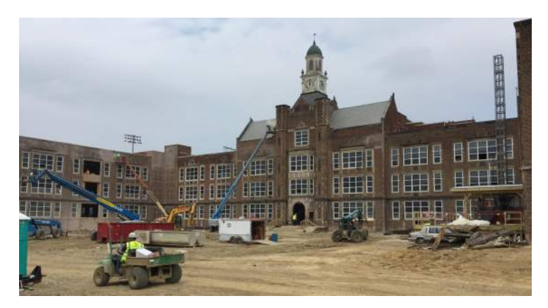
Courtyard masonry restoration & buck hoist construction