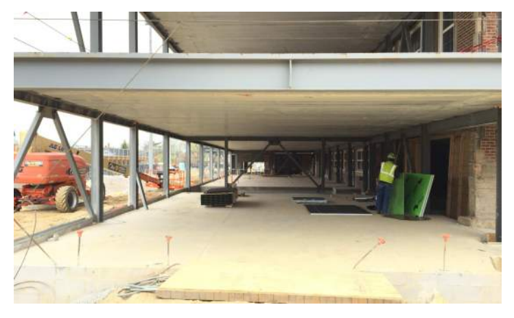
Area A Washington level exterior studs starting