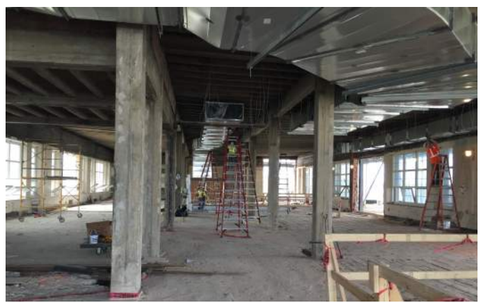
Area A 3rd Floor ductwork installation