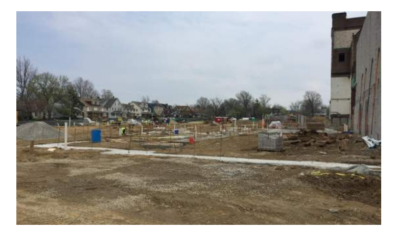
Area C footers