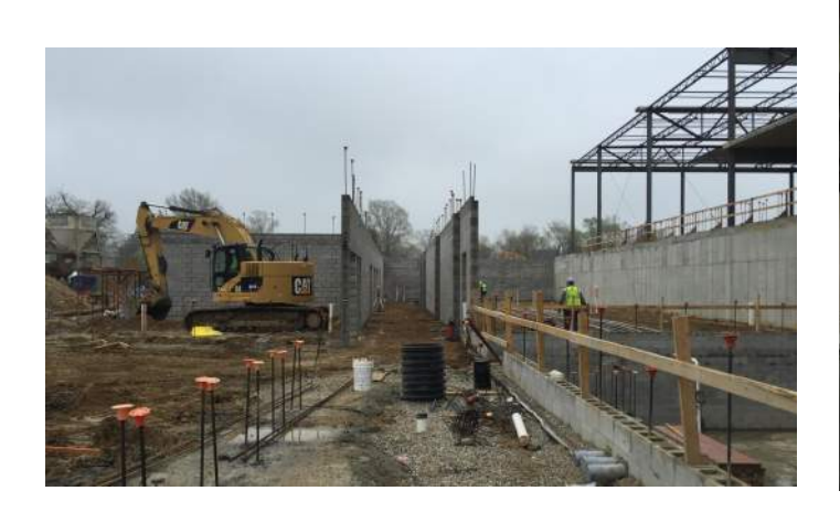
Masonry walls in Area D Washington level