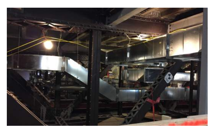
Area G 4th floor ductwork