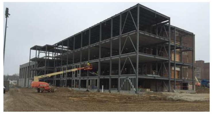
Exterior stud framing in Area A Washington & Cedar level