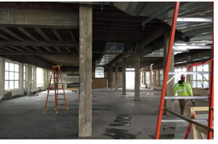
Area A 3rd floor topping slab