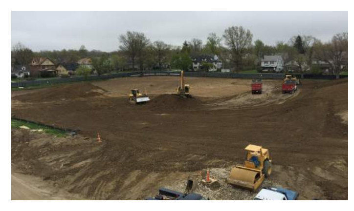
Baseball field topsoil stripping & stockpiling