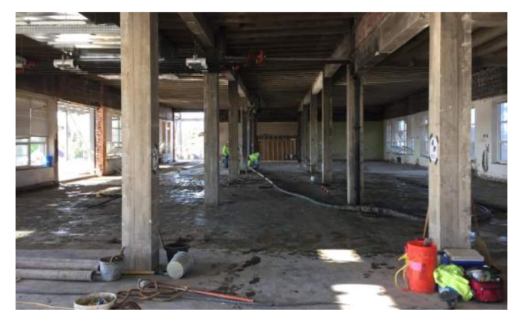
Area A Topping Slab Placement