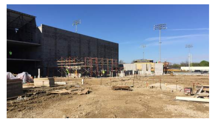
Area C Masonry Walls