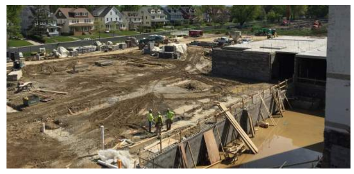
Area C Washington Level (East)