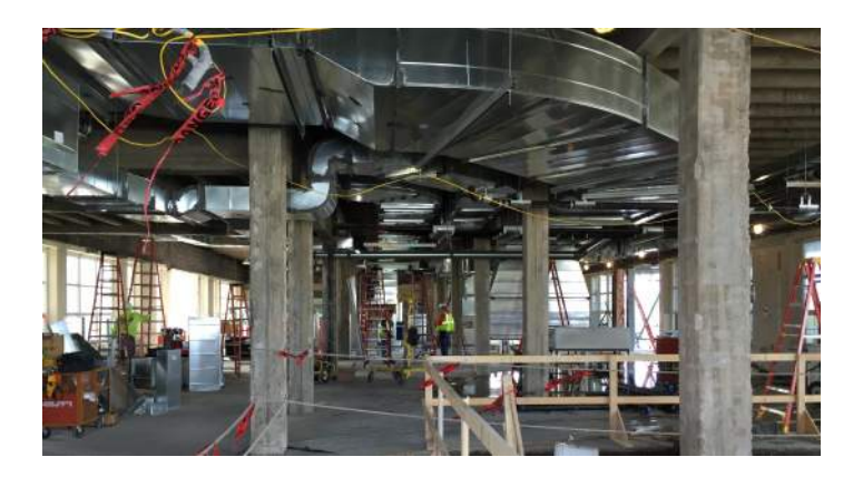
Area A 3rd Floor HVAC Ductwork & Piping