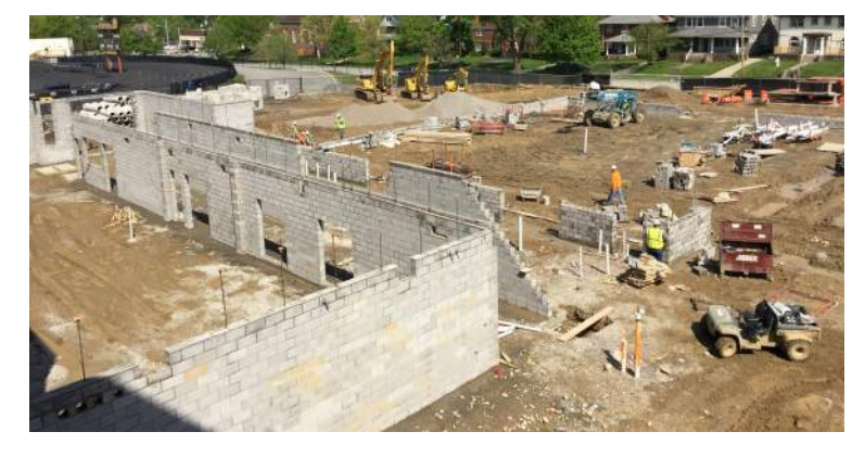
Area C Washington Level (West)