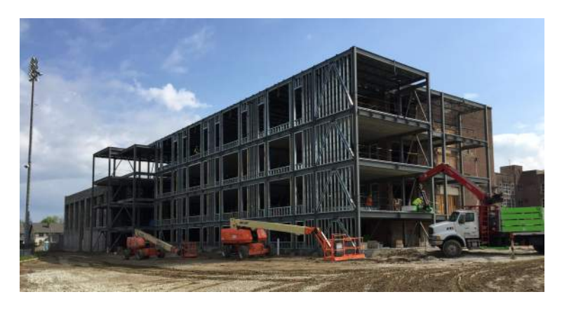
Area A Exterior Studs