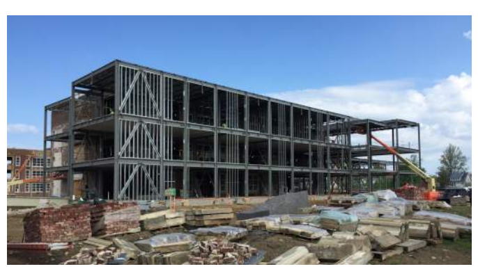
Area A F Exterior Studs