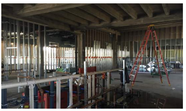
Interior Framing 3rd Floor Area F