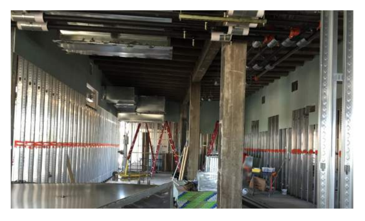
Drywall Tops of Wall 3rd Floor Area F