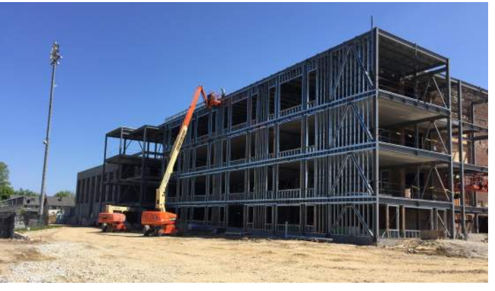
Parapet Framing Area A