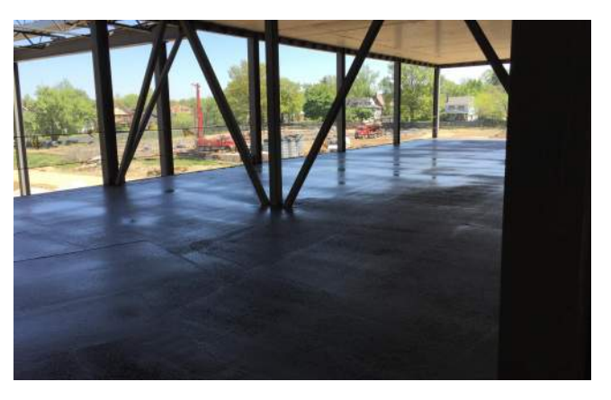
Topping Slab Pour 2nd Floor Area F