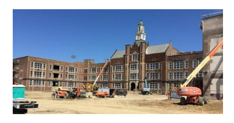
Courtyard Masonry Restoration