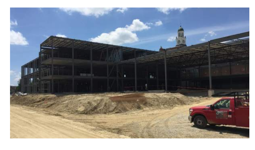
Area E & F Structural Steel