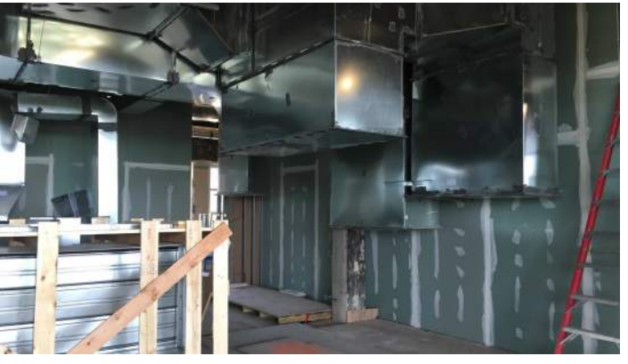
Electrical/Mechanical room drywall finishing