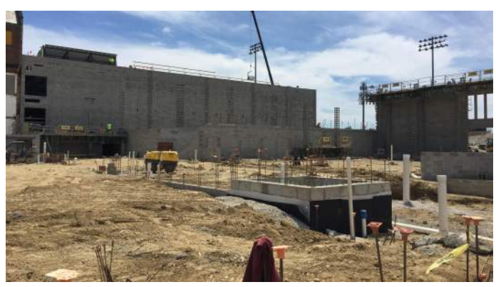
Masonry in Area C