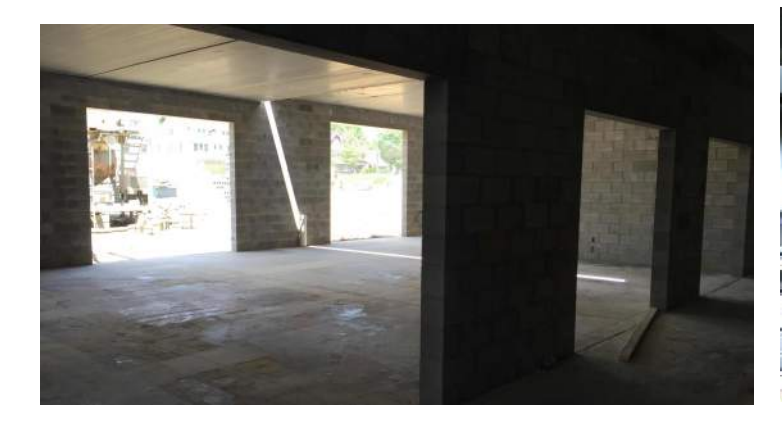
Slab on grade in Area D Washington level