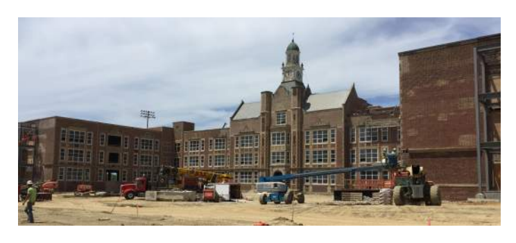
Courtyard restoration in progress