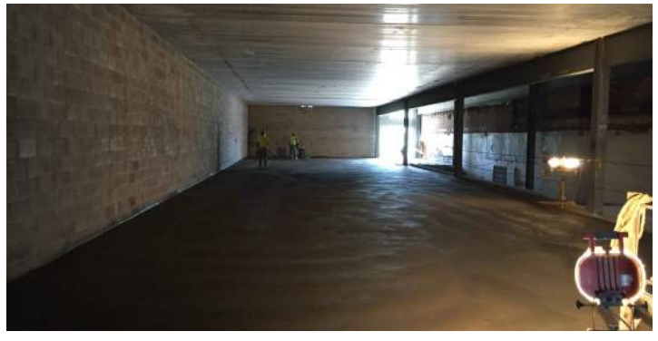
Slab on grade in Area A Cedar level