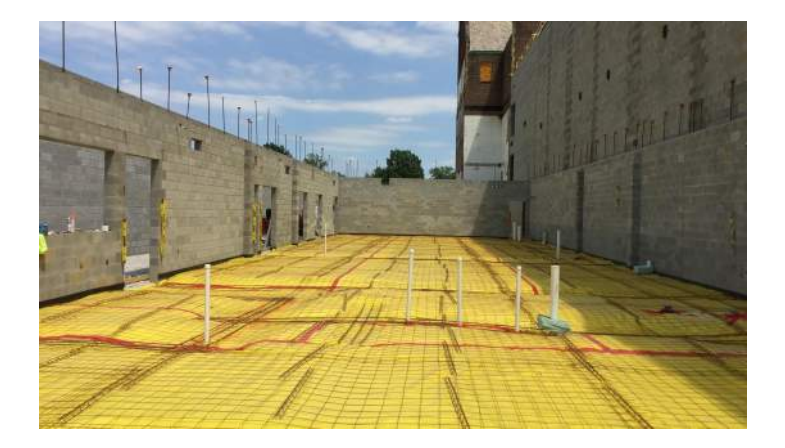
Area C Prep for Slab-On-Grade Pour