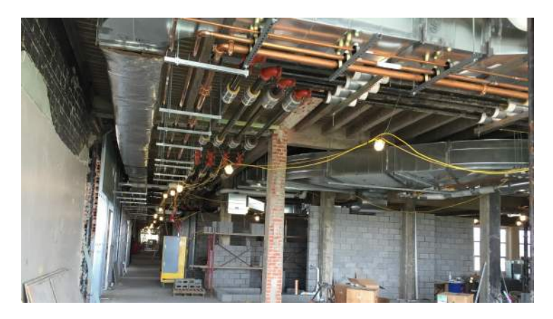
Area A 3rd Floor HVAC Piping & Duct Insulation