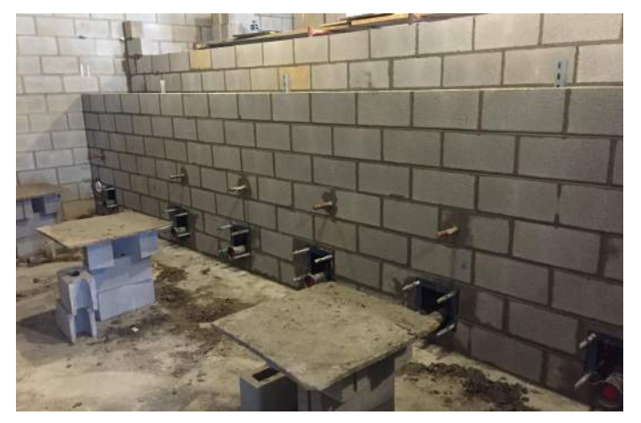
Area A 3rd Floor Bathroom Masonry