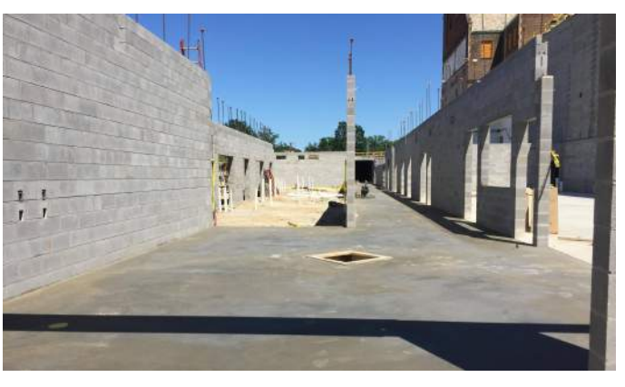
Area C Slab-On-Grade