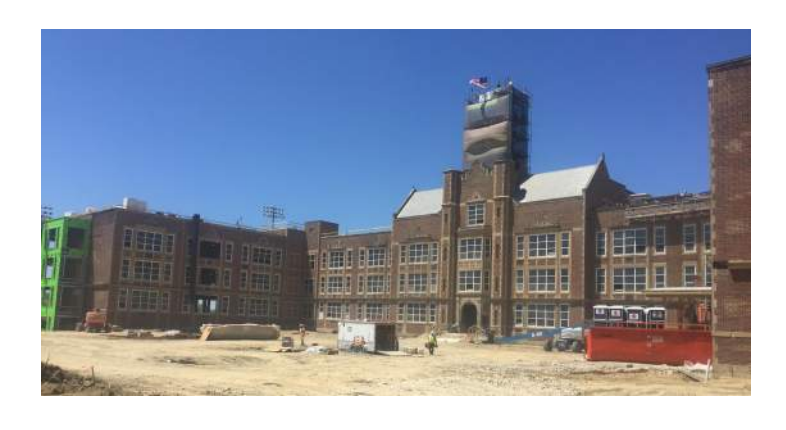
Courtyard & Clock Tower Restoration