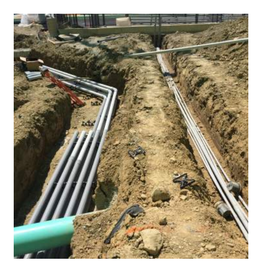
Area A Electrical Duct Banks