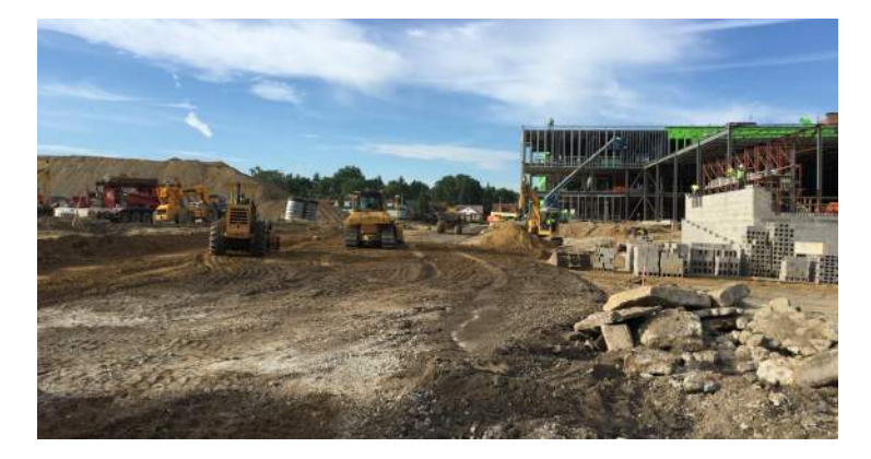
Grading East Roadway