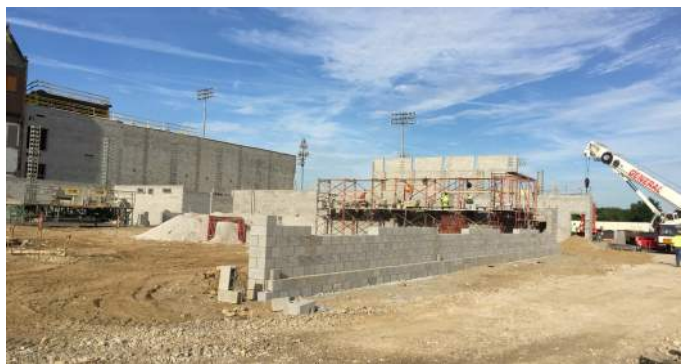
Masonry Walls Area C Washington Level