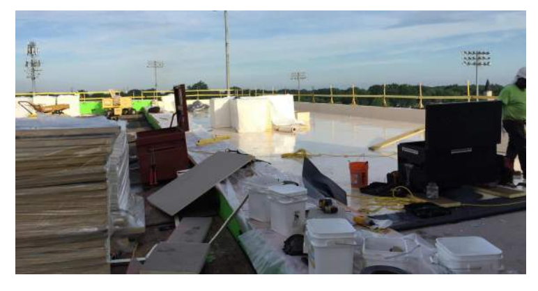
New Roofing Area A North