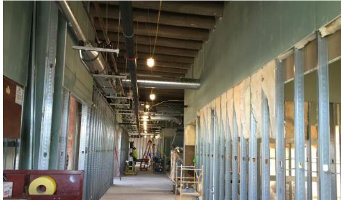
Sprinkler Piping Third Floor Area A