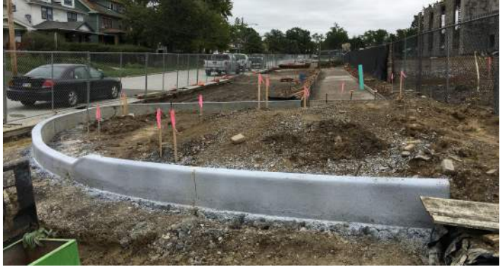
Curbs & Sidewalk Prep Work