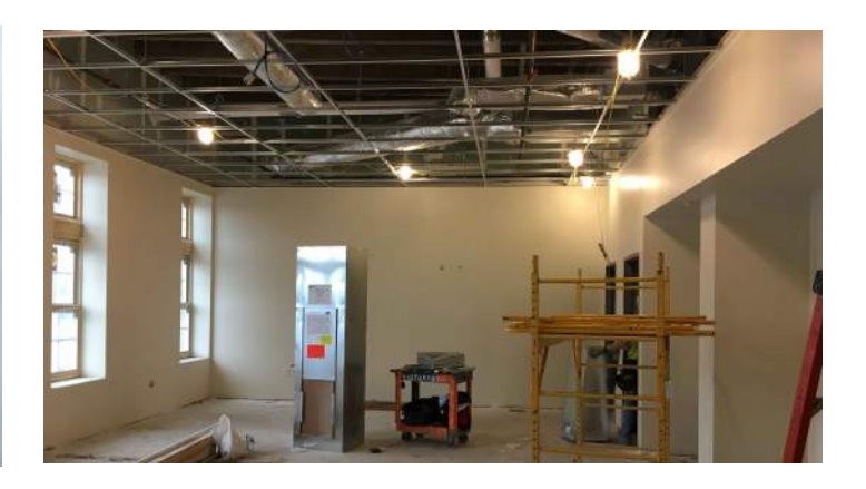
Mock-Up Room Painting & Ceiling Grid