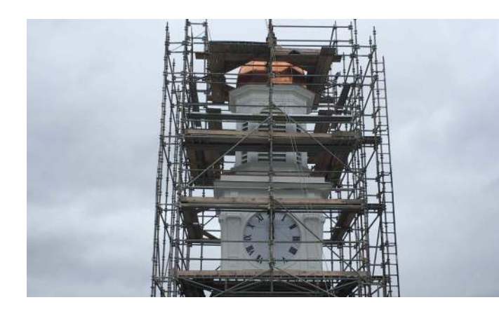
Clock Tower Restoration