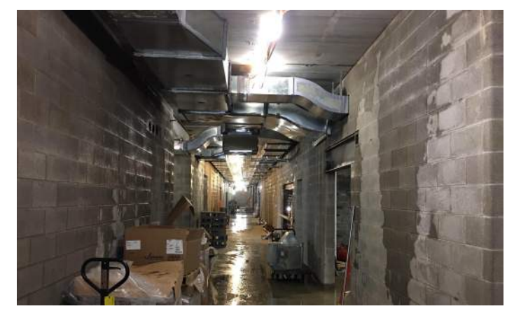
HVAC & HVAC Pipe Hangers