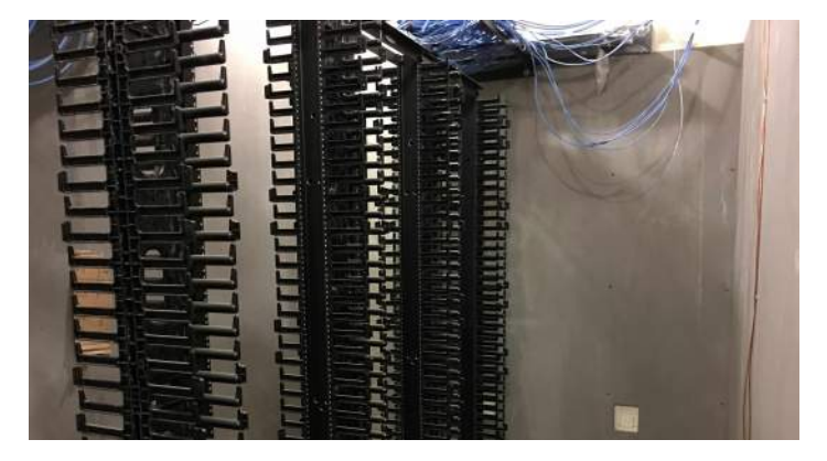
Area A 3rd Floor Data Room