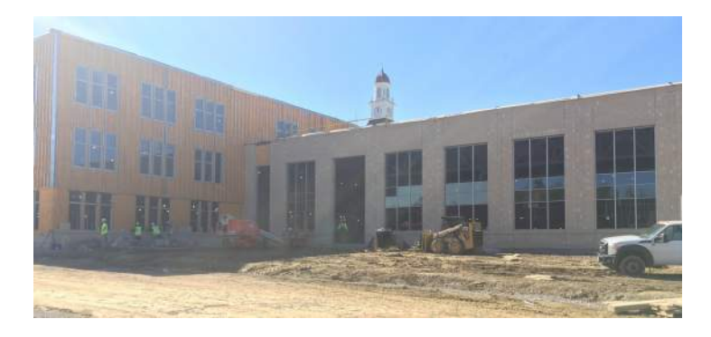
Veneer Stone & Window Installation Areas E & F