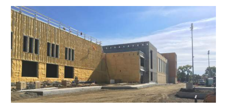
Curbs, Sidewalks & Frost Slabs West Drive