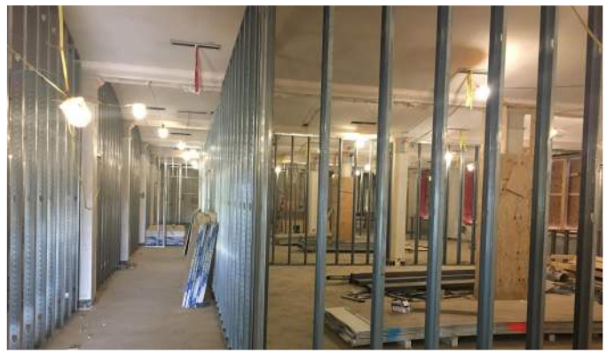
Metal Stud Framing Area G Art Level