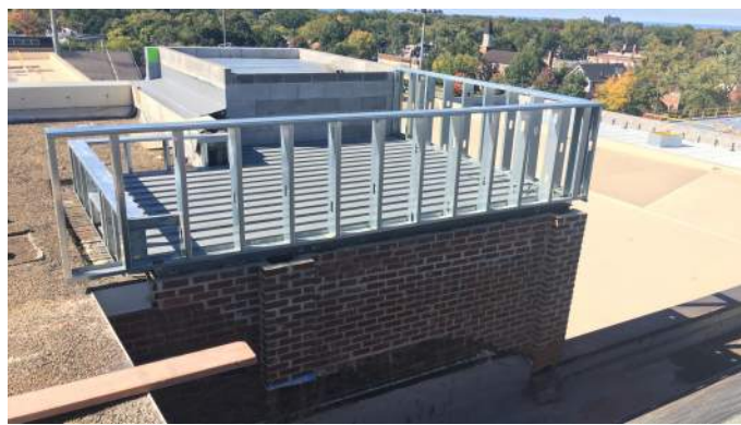
Rebuilding Parapet Area A Roof