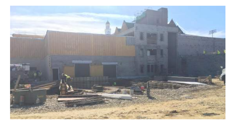
Loading Dock Retaining Wall Construction Area D